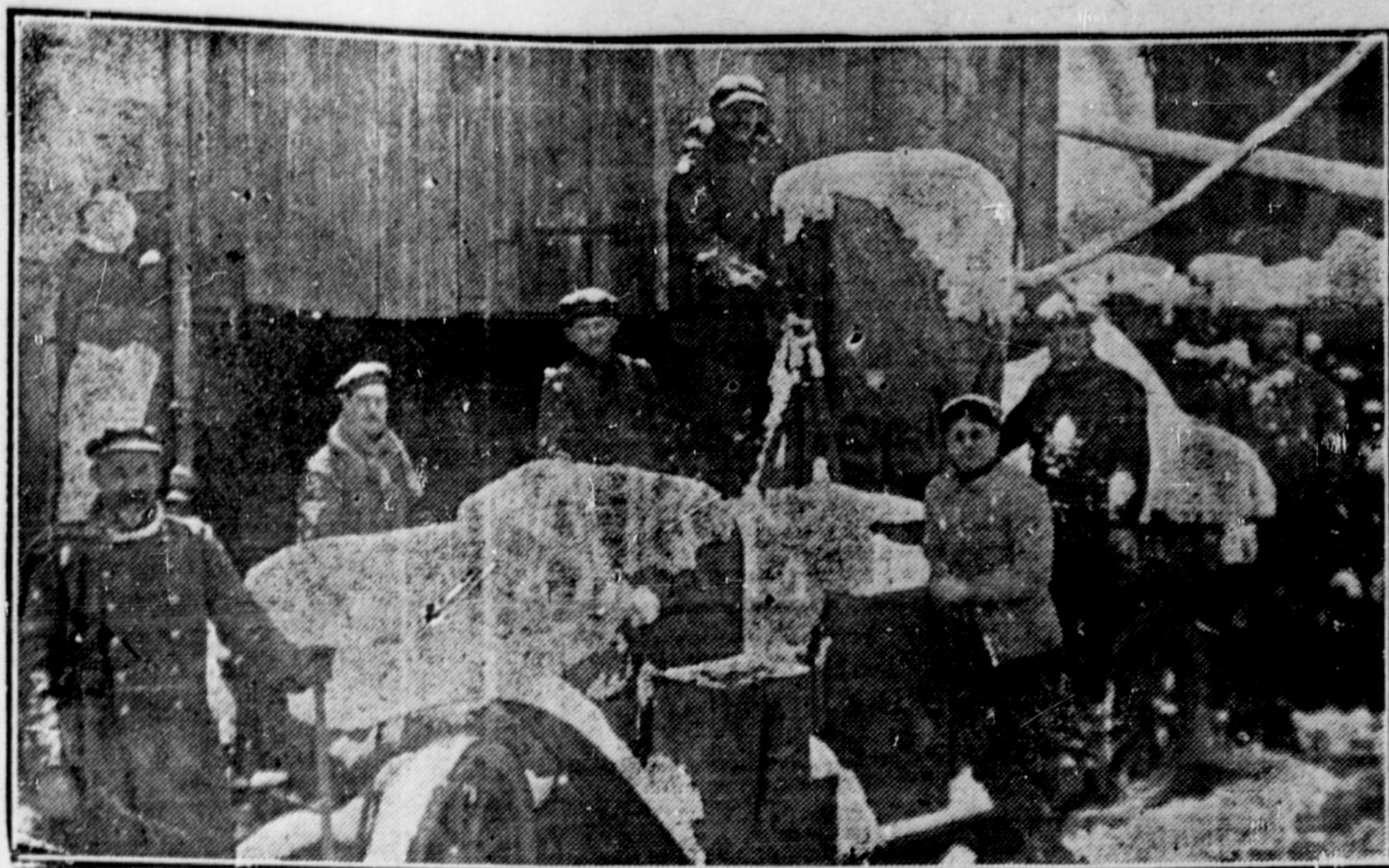
Winter with the French army.—First snow in the Argonne showing a French naval motor searchlight returning from an all night observation tour.

Dated this 23rd day of December, A. D. 1915. A. D. 2.