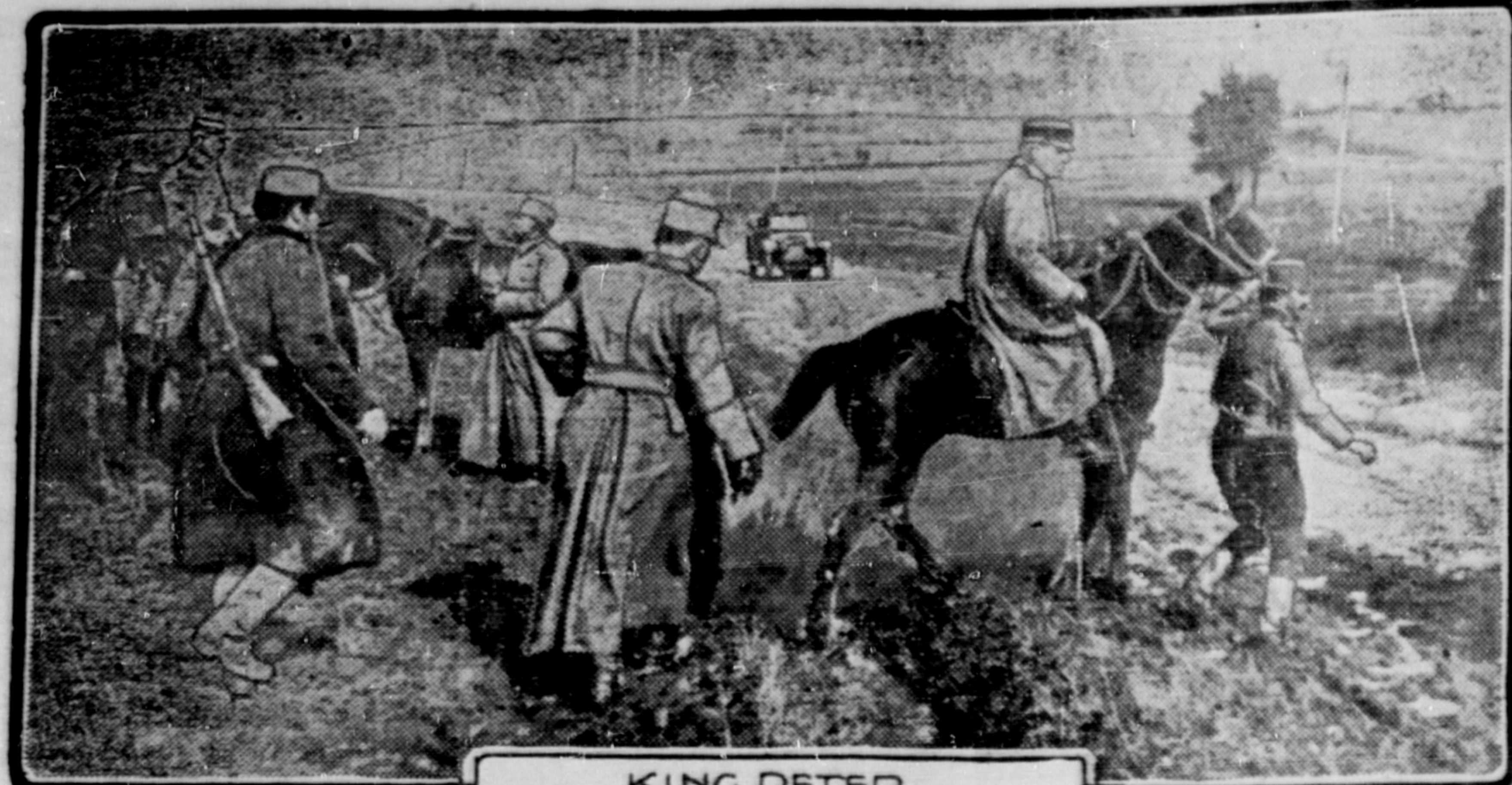
KING PETER WATCHING THE RETREAT