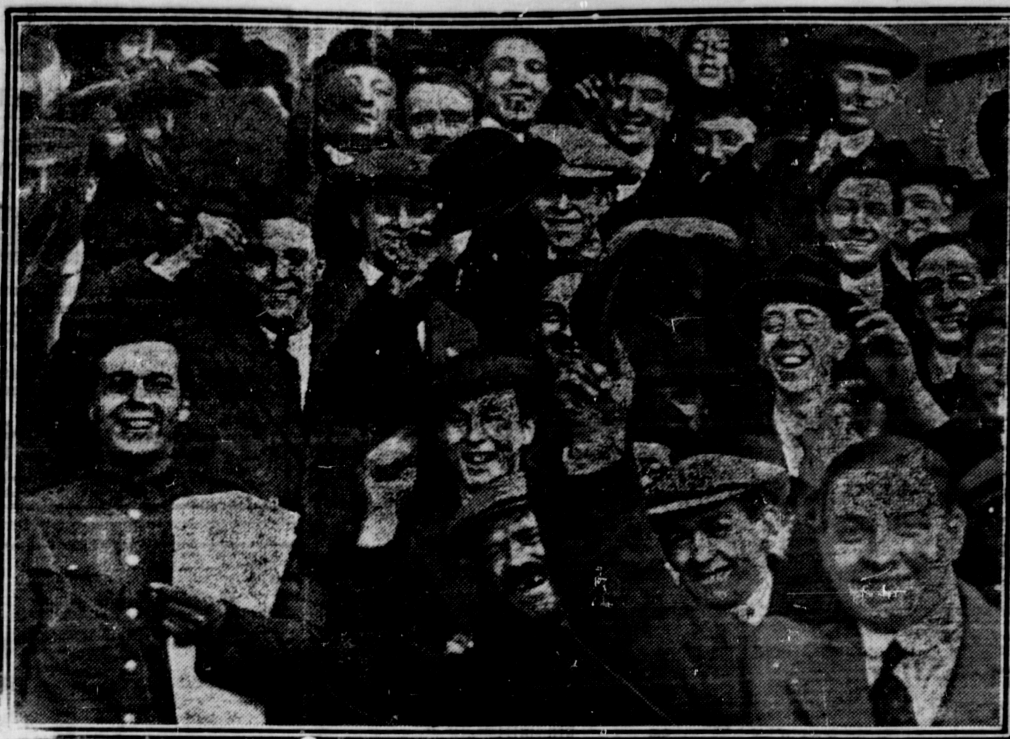
LAST MINUTE DERBY RECRUITS.—The pressure of would-be recruits on the last day of the Lord Derby Recruiting Campaign was such that the recruiting offices could not close their doors, and the work was extended over Sunday. It was a physical impossibility to cope with the crowds.

Dated this 23rd day of December, A. D. 1915. Apr. 2.