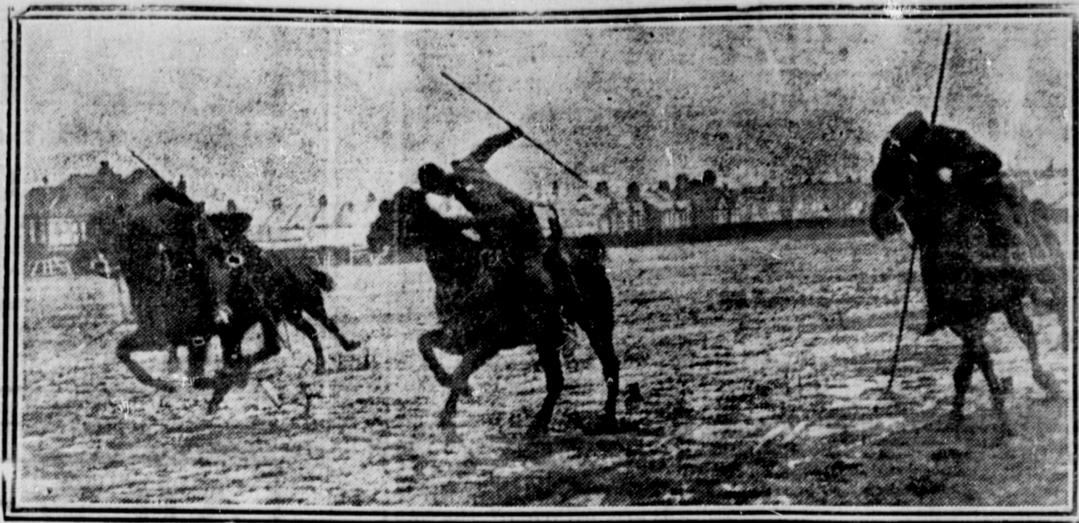
CANADIAN CAVALRY PRACTICE FOR CHARGE ON THE GERMANS.—While waiting for orders to start against the German lines, Canadian cavalymen practice at sword fighting. The horses are protected as well as the men with hoods and pads against sword cuts and injuries.