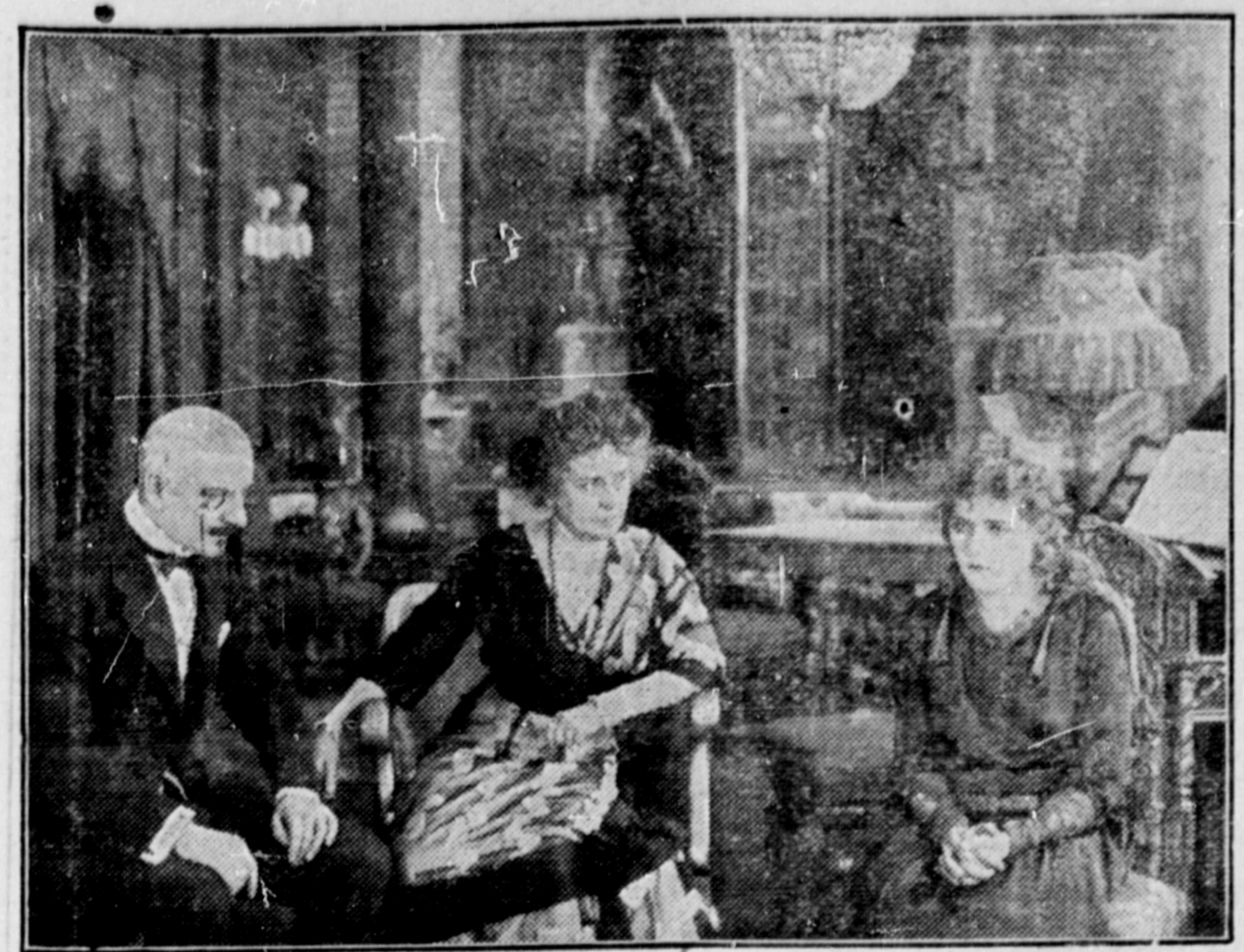
MARY PICKFORD IN "RAGS" AT THE WESTHOLME TONIGHT