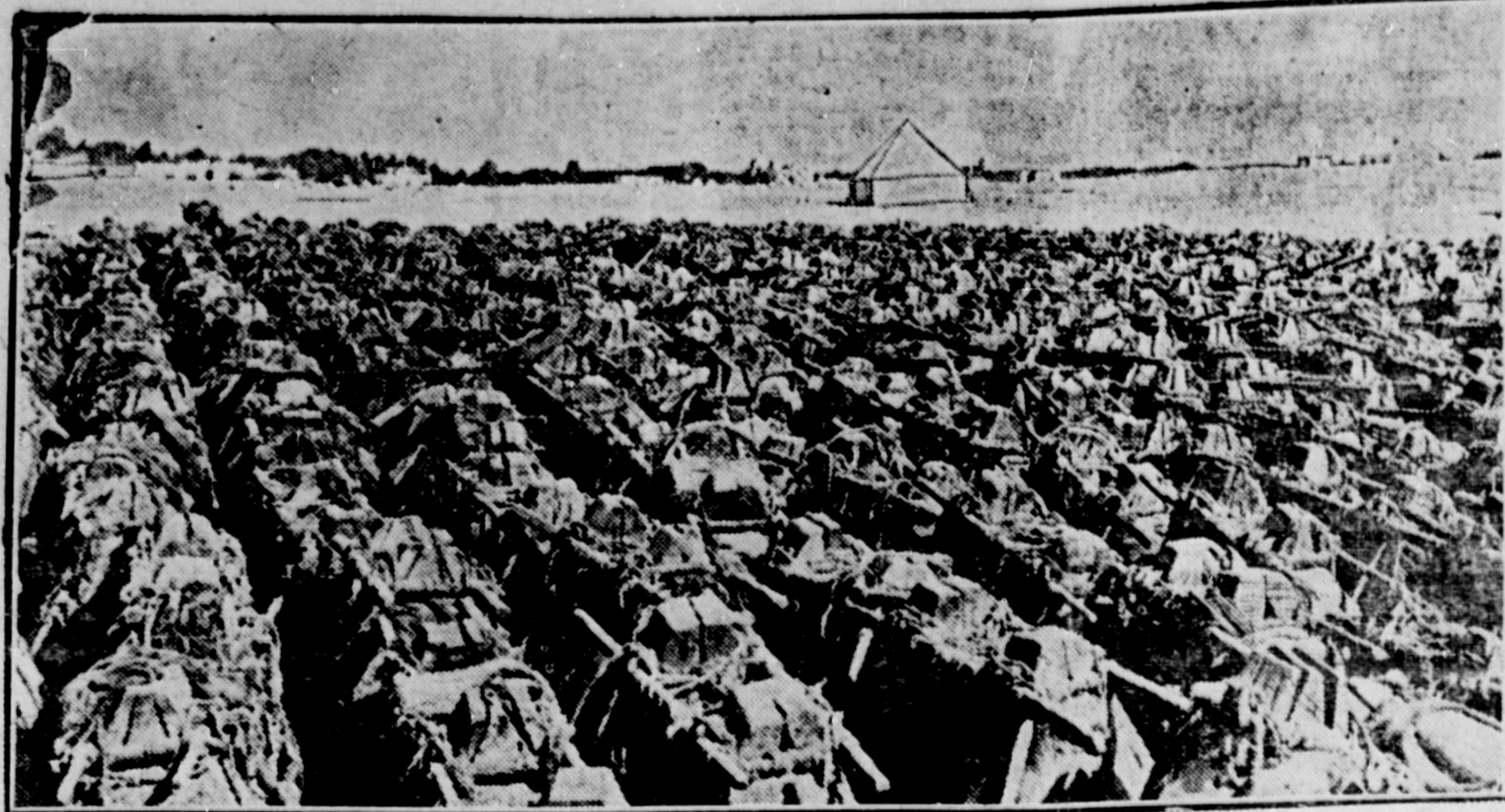
THE "LAST STRAWS" TO BREAK THE CAMEL'S BACKS—These myriad saddles for camels were photographed at a camp near Cairo, where they are being supplied for the campaign in Tripoli