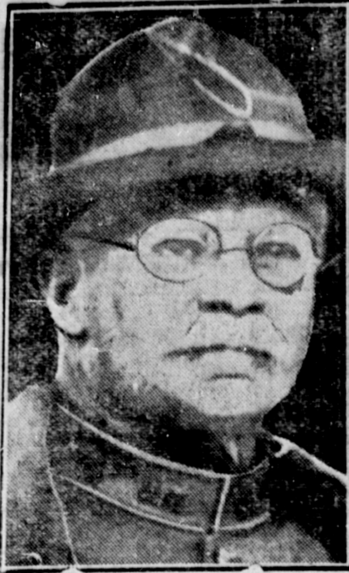
GENERAL HUGH SCOTT