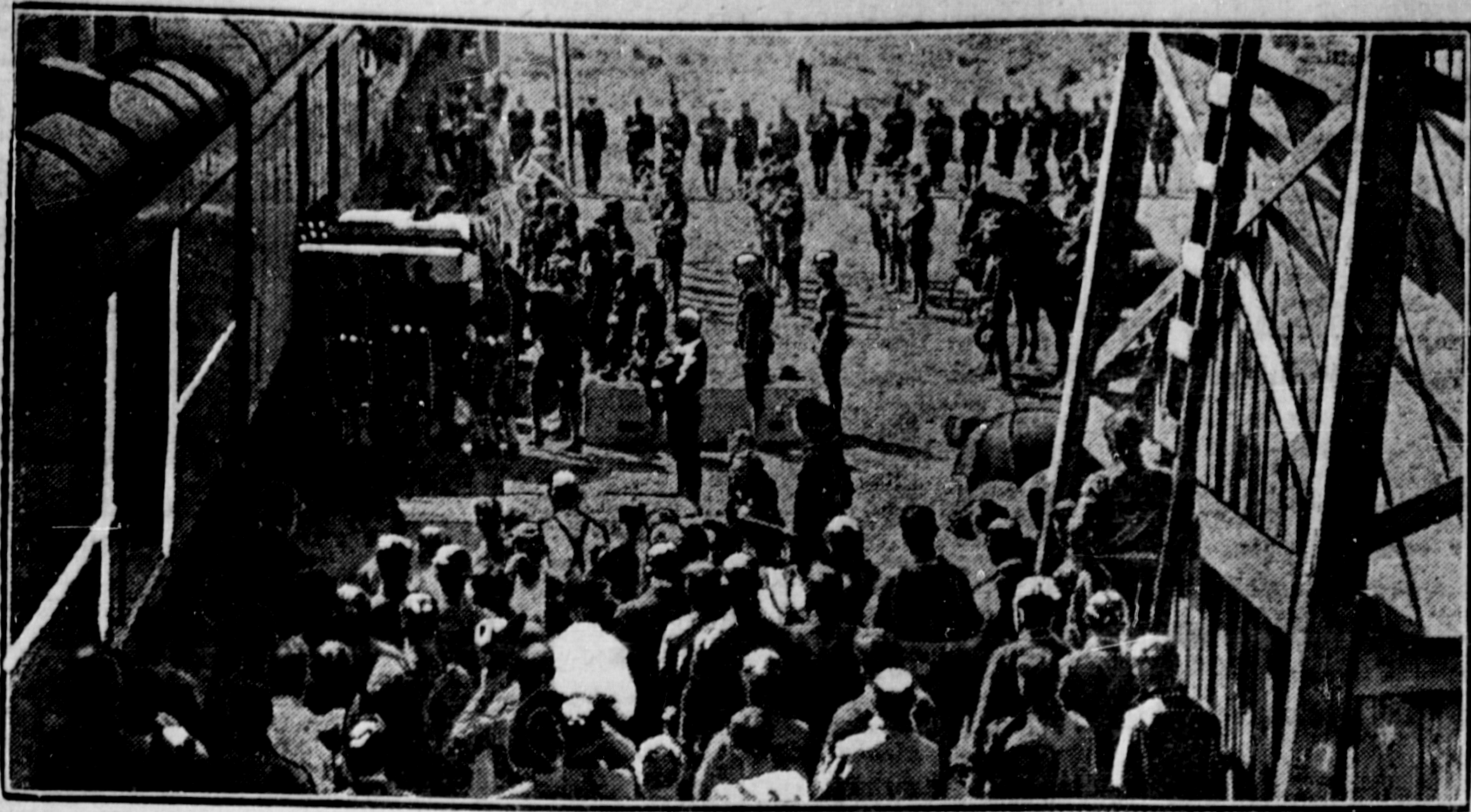
IN COLUMBUS, NEW MEXICO, SCENE OF VILLA'S RAID.—In this picture American soldiers are seen placing the bodies of their dead comrades on board an out-going train, while the band plays a dirge.