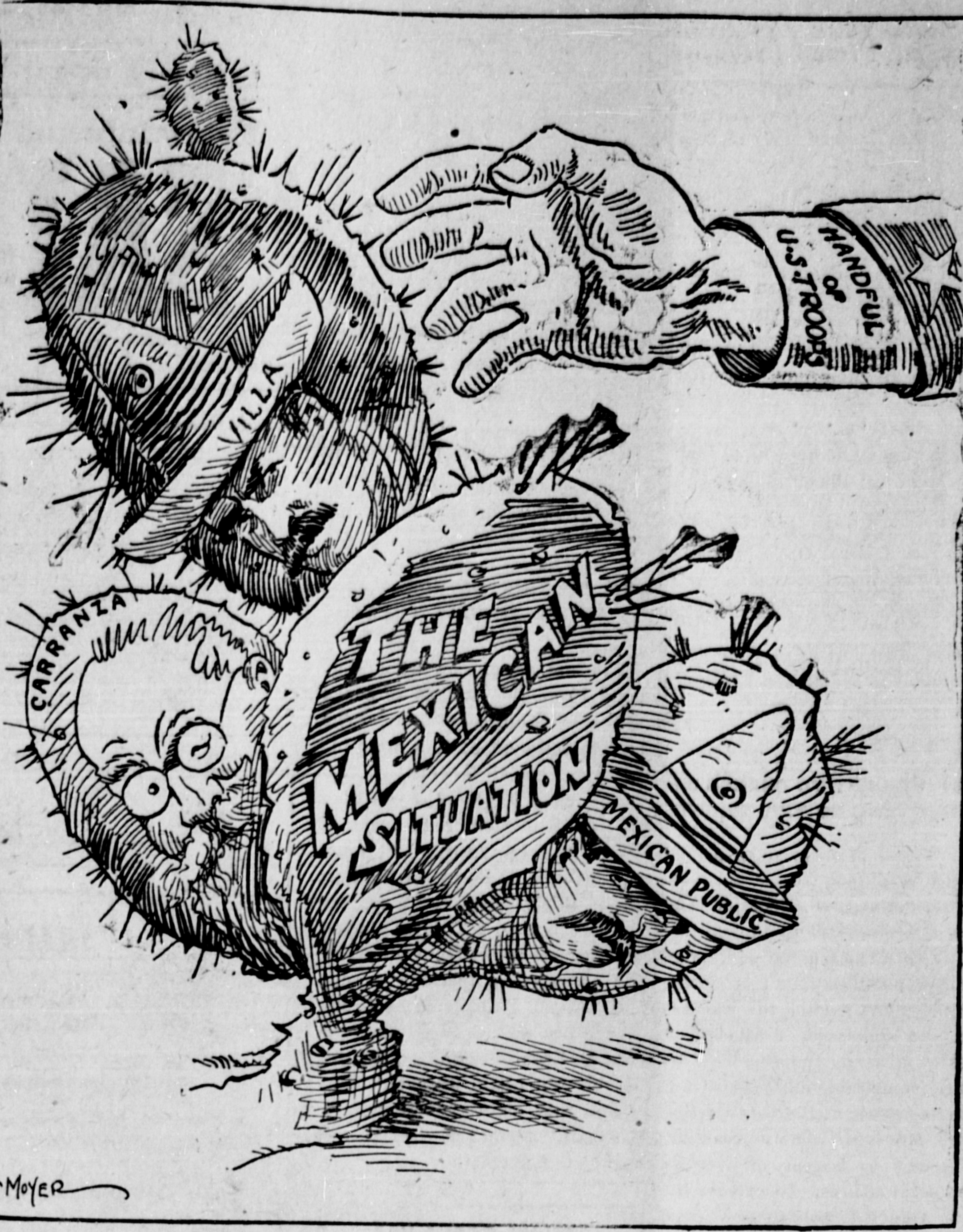
"TENDER-HANDED GRASP A NETTLE, AND IT STINGS YOU FOR YOUR PAINS."