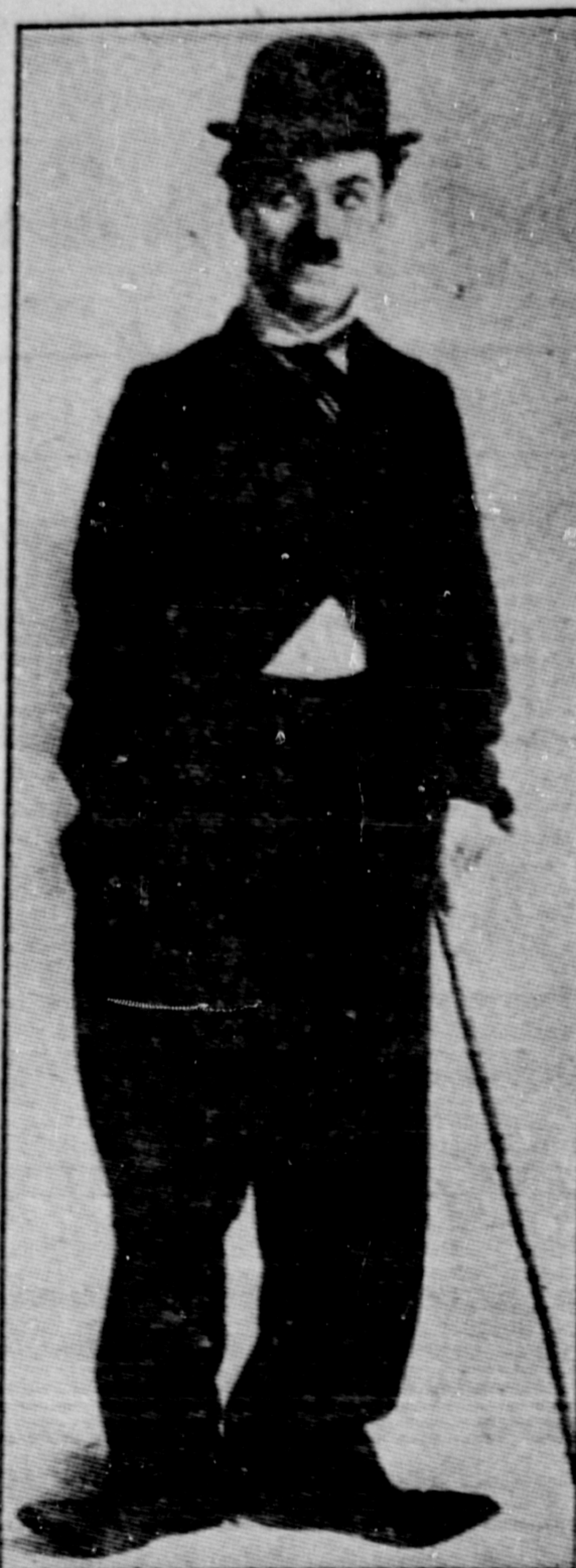
SIX-REEL CHAPLIN AT WESTHOLME THEATRE