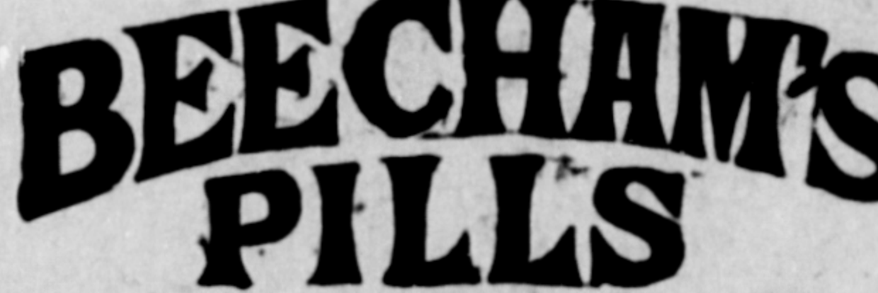
Largest Sale of Any Medicine in the World. Sold everywhere. In boxes, 25 cents.

Help Digestion To keep your digestive organs in good working order—tostimulate your liver, tone your stomach and regulate your bowels, take—