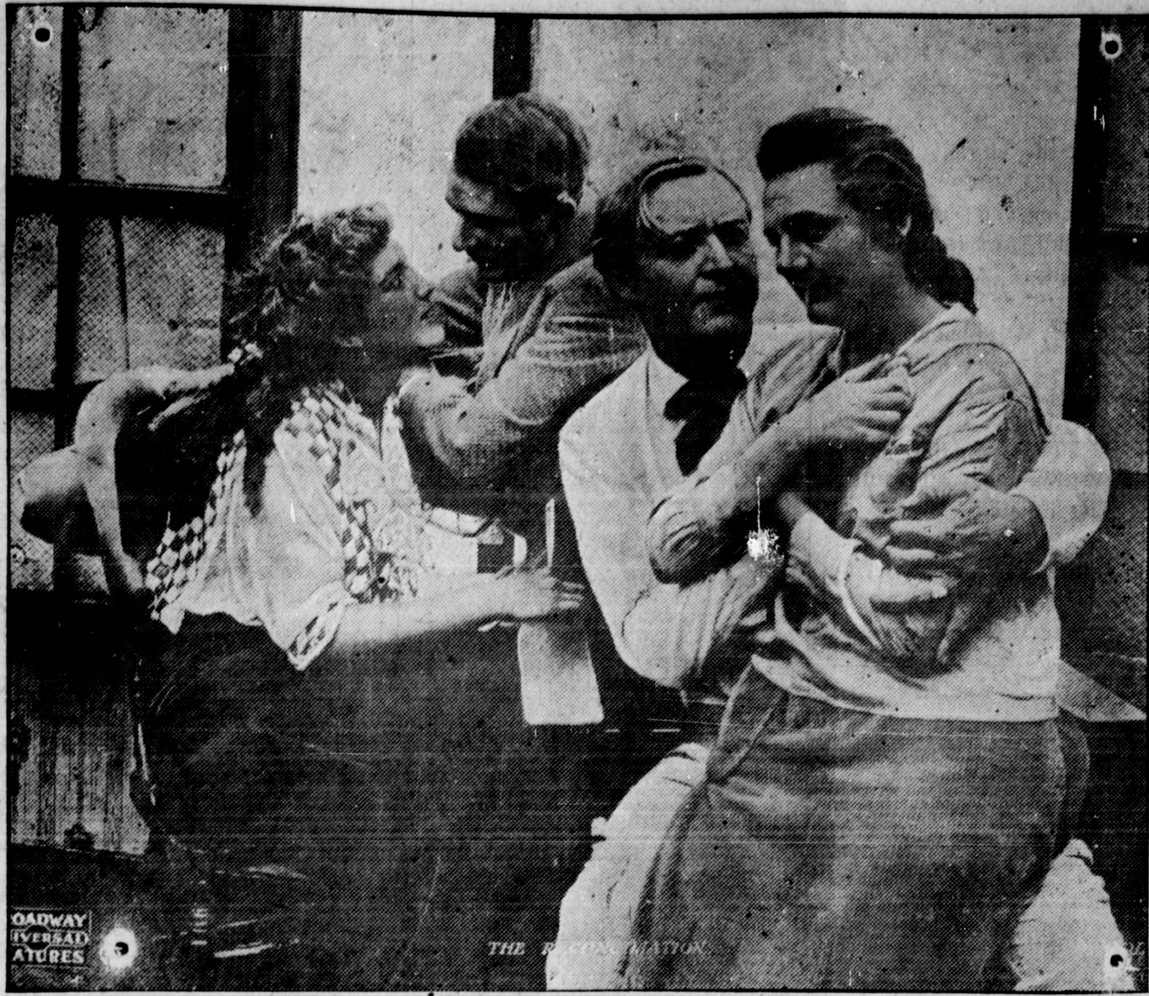
SCENE FROM "COLORADO" AT THE WESTHOLME THEATRE TONIGHT