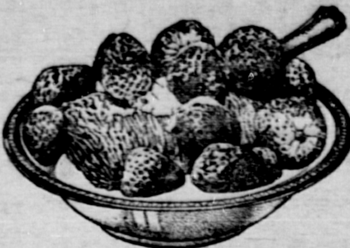
Made in Canada.

Open Up a Health Account that will yield greater enjoyment of life and higher efficiency in work. Cut out heavy winter foods and eat Shredded Wheat Biscuit with fresh fruits and green vegetables. Shredded Wheat is ready-cooked. Delicious for breakfast with milk or cream; for luncheon or any meal with berries or other fruits.