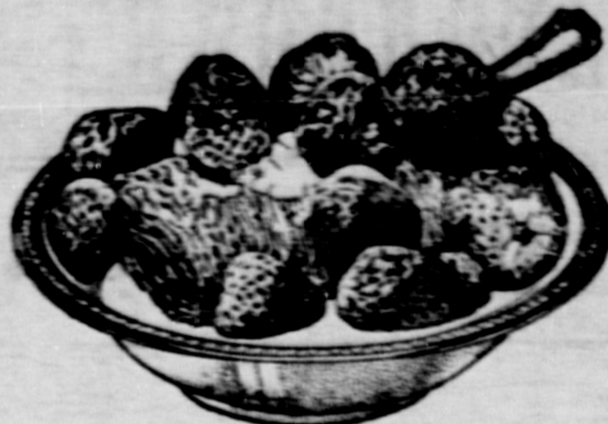
Made in Canada.

Open Up a Health Account that will yield greater enjoyment of life and higher efficiency in work. Cut out heavy winter foods and eat Shredded Wheat Biscuit with fresh fruits and green vegetables. Shredded Wheat is ready-cooked. Delicious for breakfast with milk or cream; for luncheon or any meal with berries or other fruits.