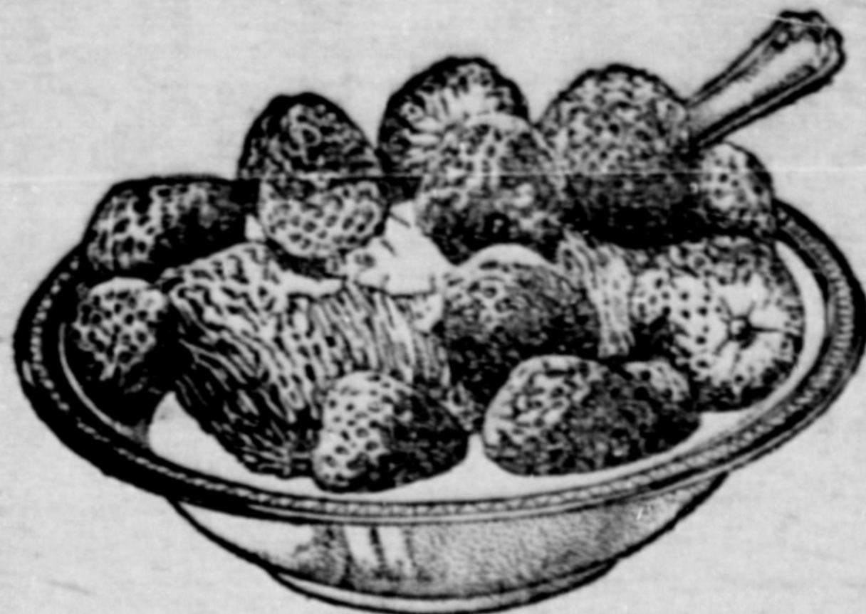
Made in Canada.

You Owe Yourself this Rare Treat after the heavy meats and the canned vegetables of the Winter—with a jaded stomach and rebellious liver— Shredded Wheat with Strawberries —a dish that is deliciously nourishing and satisfying—a perfect meal, and so easily and quickly prepared. For breakfast, for luncheon or any meal.