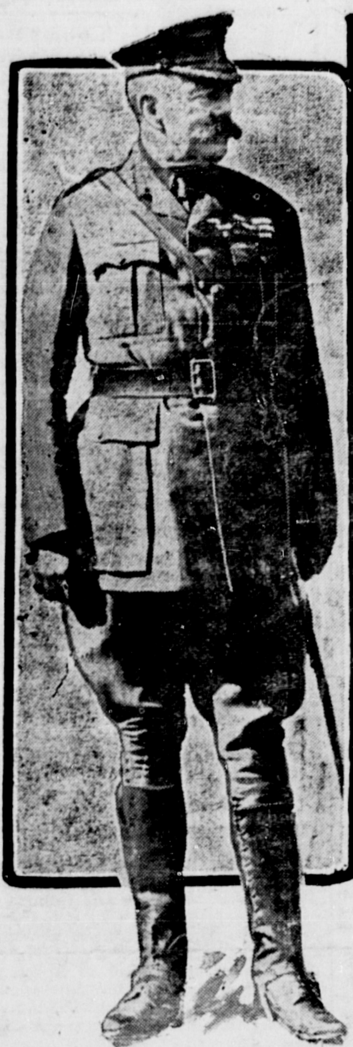
HIS LATEST SNAPSHOT

TONIGHT IS SCOTCH NIGHT In between shows a great Concert devoted to Scotch music, songs and dances will be given. Come and hear the Prince Rupert Harry Lauder—He is as good as the old man himself. JUNE 23rd IS CHAPLIN NIGHT