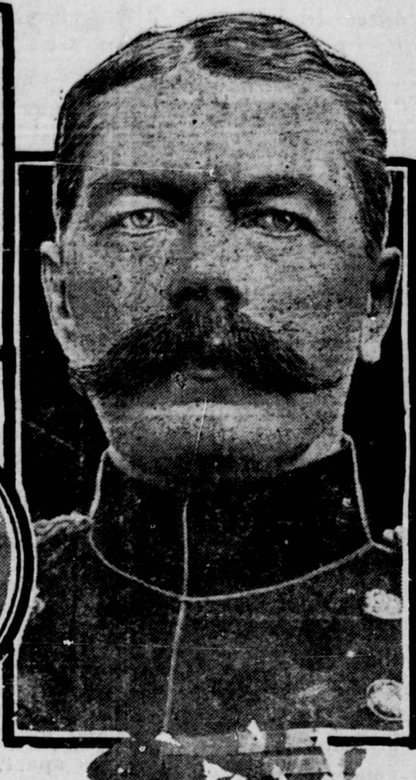
HIS LATEST PORTRAIT.

EARL KITCHENER IN MANY ACTIVITIES, AND THE CRUISER HAMPSHIRE ON WHICH HE MET HIS FATE