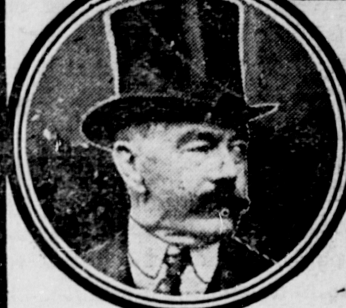
AT HOUSE OF LORDS