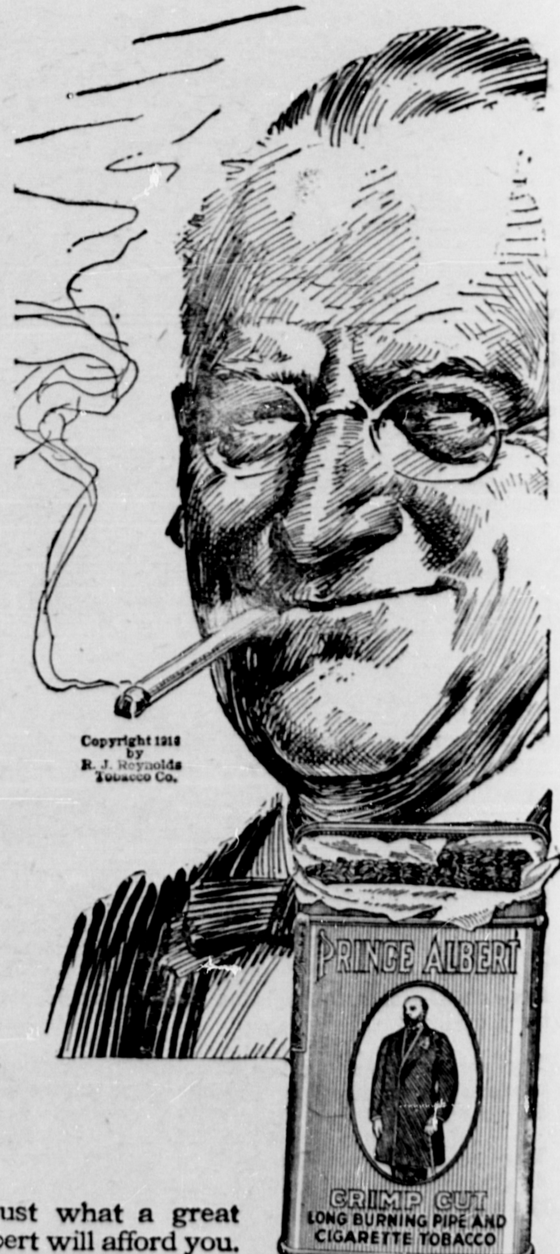
Copyright 1916 by R. J. Reynolds Tobacco Co.

Prince Albert is sold throughout Canada, generally, in the ½-lb. tidy red tin, also in pound and half-pound humidors. R. J. REYNOLDS TOBACCO CO., Winston-Salem, N. C., U. S. A.