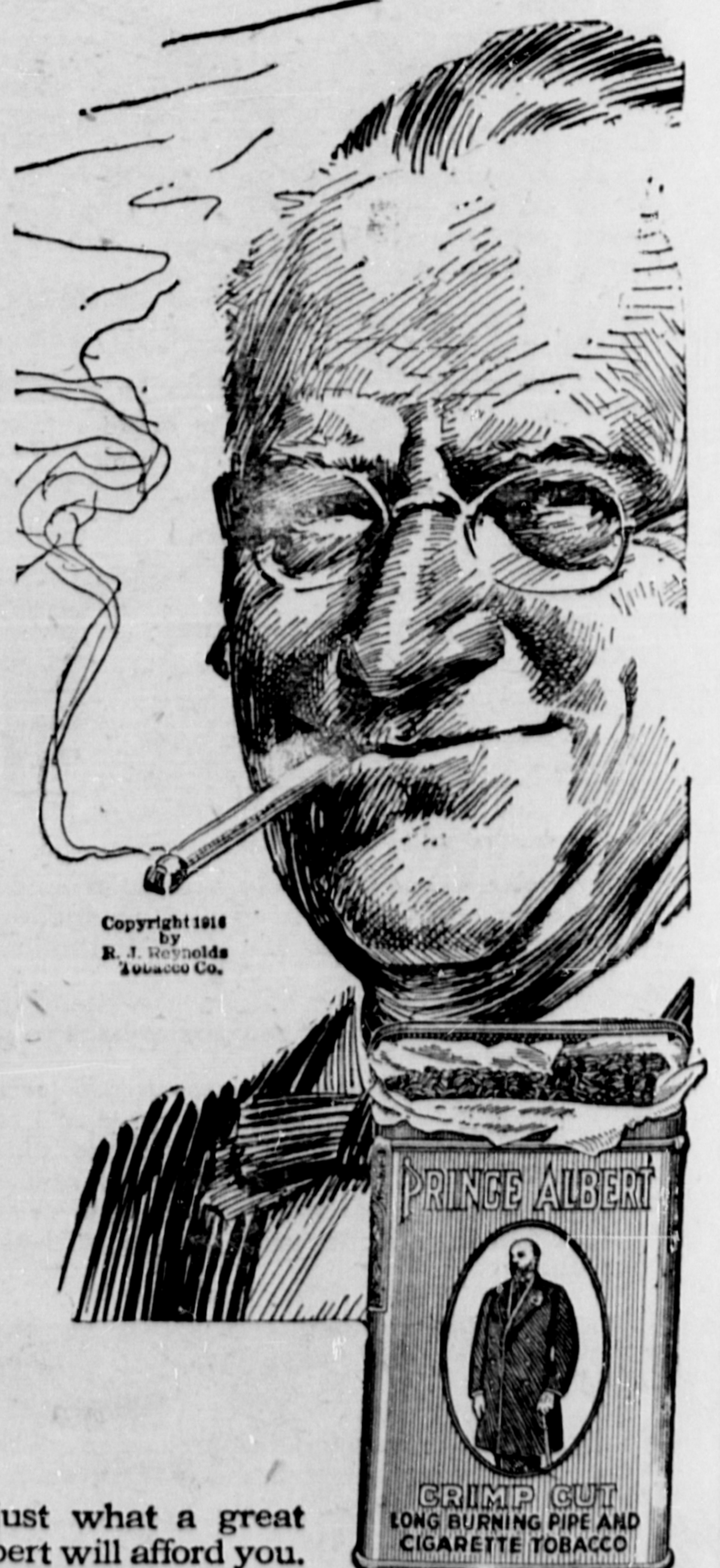
Copyright 1916 by R. J. Reynolds Tobacco Co.

R. J. REYNOLDS TOBACCO CO., Winston-Salem, N. C., U. S. A.