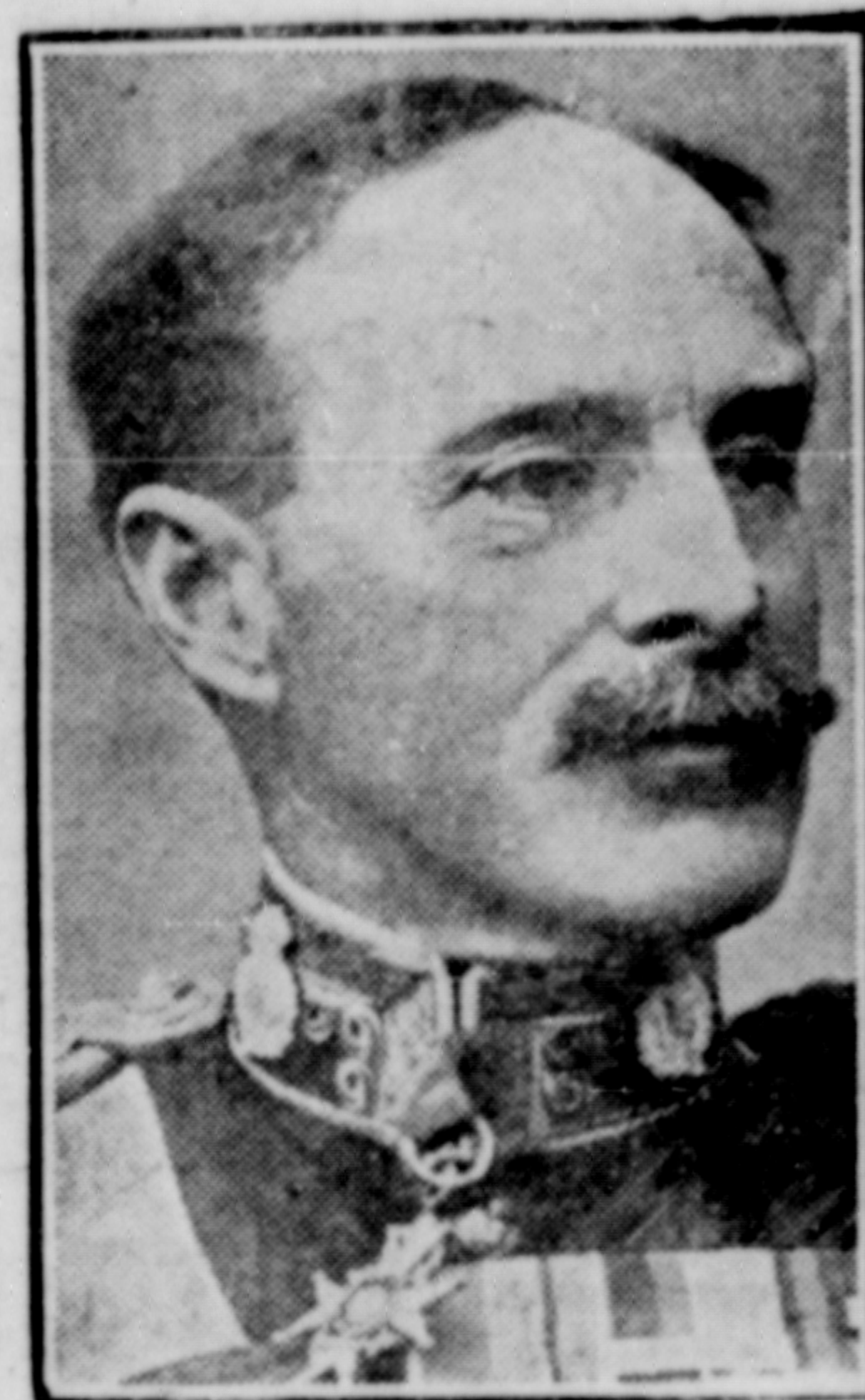
Sir Douglas Haig, in com- mand on Western Front

The British Admiralty and War Office ordered these pictures taken to show the Allies, Britain, and the Colonies, what Britain is really doing. Your only chance to see the Greatest War Pictures ever produced, on