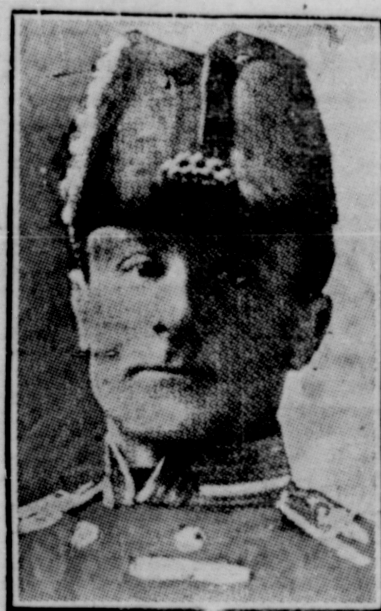
Sir John Jellicoe, Fleet Commander

PICTURES ORDERED by the BRITISH GOVERNMENT