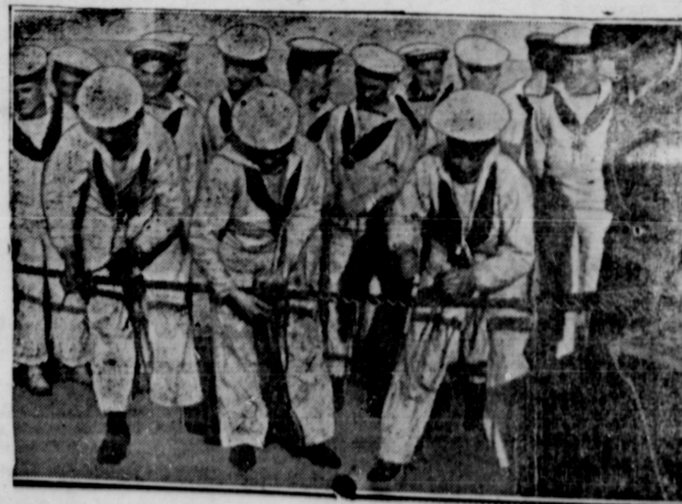
Jack Tars in the North Sea

From Montreal to Vancouver and Victoria crowds paid a Dollar to see this show. It is offered to you in