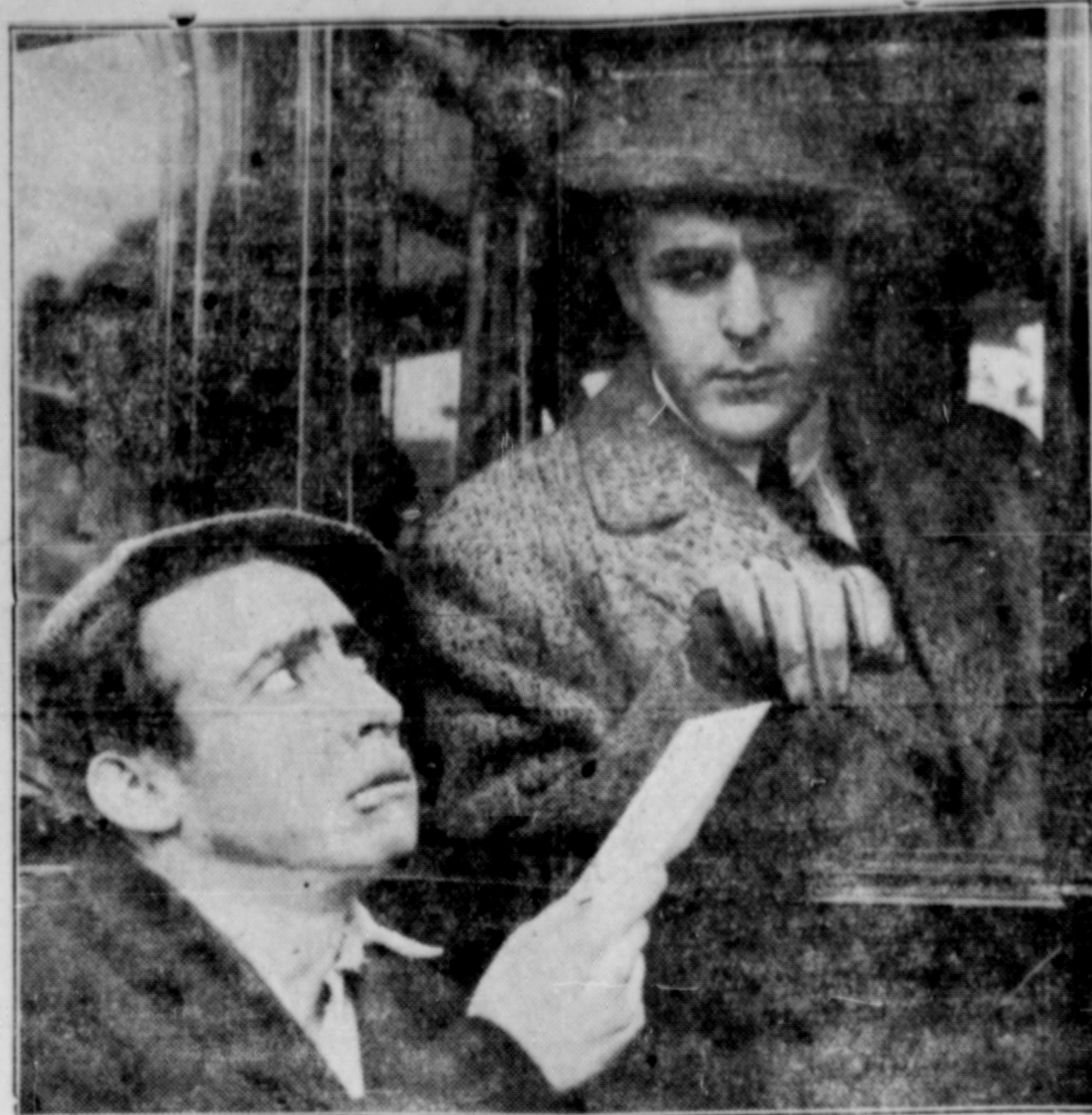
Scene from "The Golden Chance" showing at the Majestic tonight.