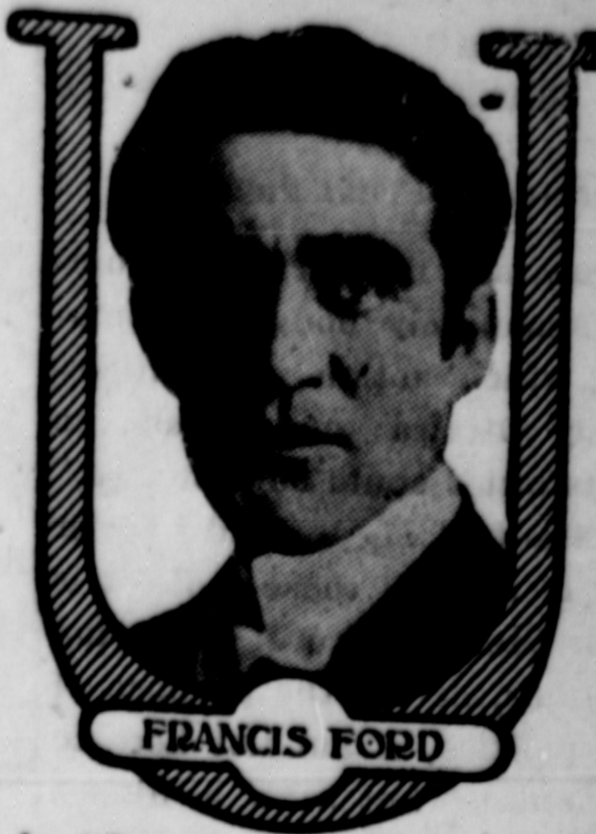
In "Peg O' The Ring" at the Westholme Theatre tonight.