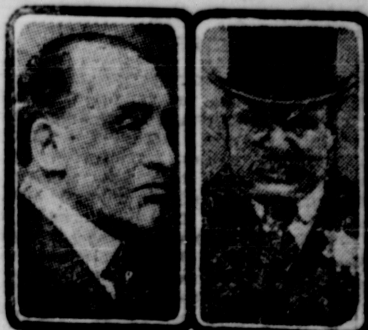
SIR ED CARSON LORD DERBY