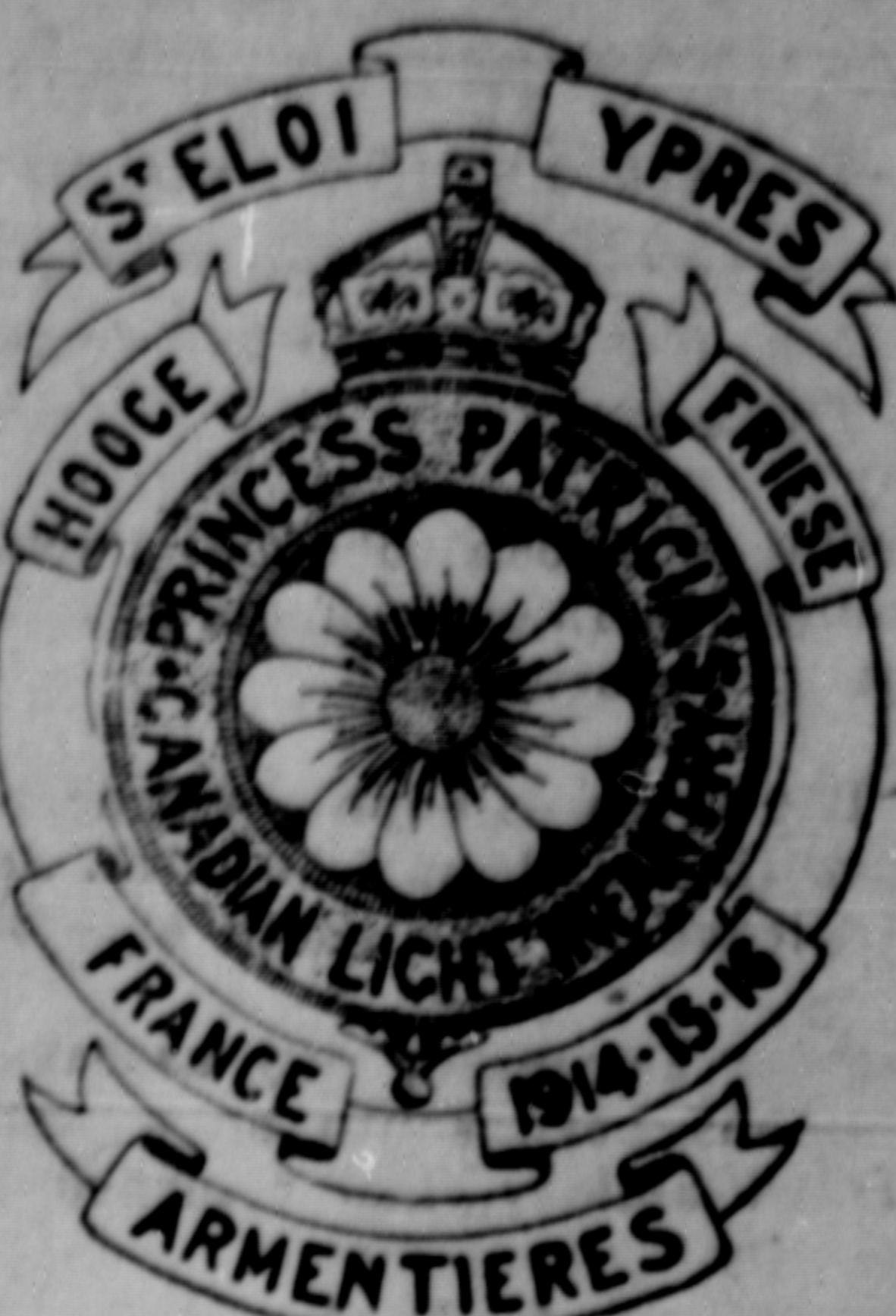
Badge of The "Princess Patricia's Light Infantry"

If Germany does not infringe upon the neutrality of the United States and if America does not do anything which may be taken as an infringement by Germany, Washington may still remain strictly neutral. If German submarines sink an American vessel, simply because that vessel is not complying with a ruling laid down by Berlin, but not agreed to by Washington, that act would be taken as an act of war. Action, however, would not be taken until the United States had made a thorough investigation into the case and had satisfied herself that a definite breach of neutrality had actually taken place. On the other hand, Germany may look upon the seizure of her interlopers as an act of war, and may immediately declare war on this score. The breaking off of relations is the laying of the fuse and the act of war is the match which sets everything in a blaze.