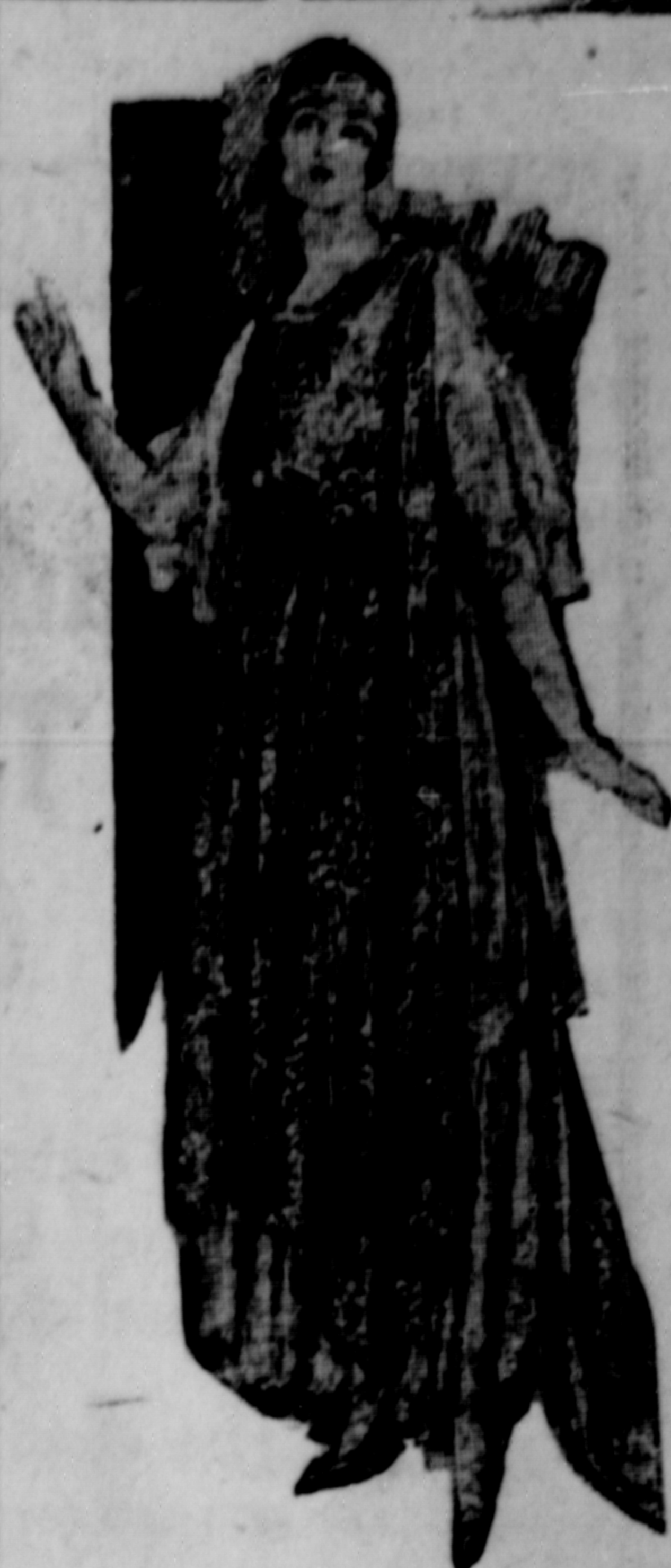
HANDSOME ENGLISH GOWN

H. LETOURNEAU 621 SIXTH AVENUE Phone Black 325 P.O. Box 118