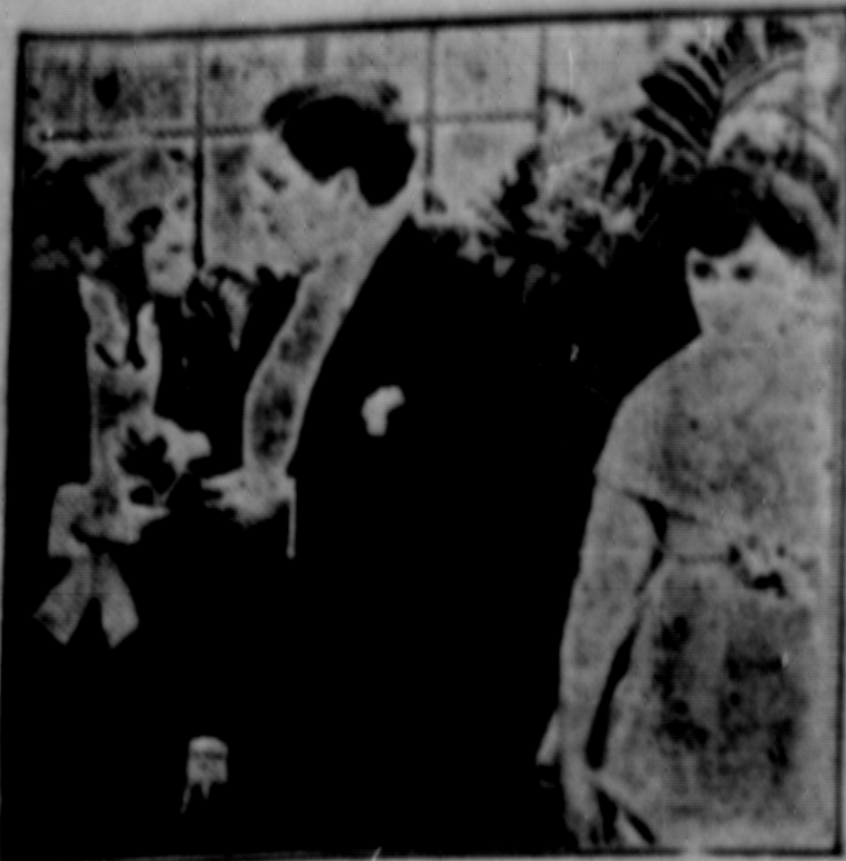
Scene from "The Gilded Fool" to be shown at the Westholme Theatre tonight.

ALBERT & McCAFFERY LIMITED Dated 22nd May, 1917. J24