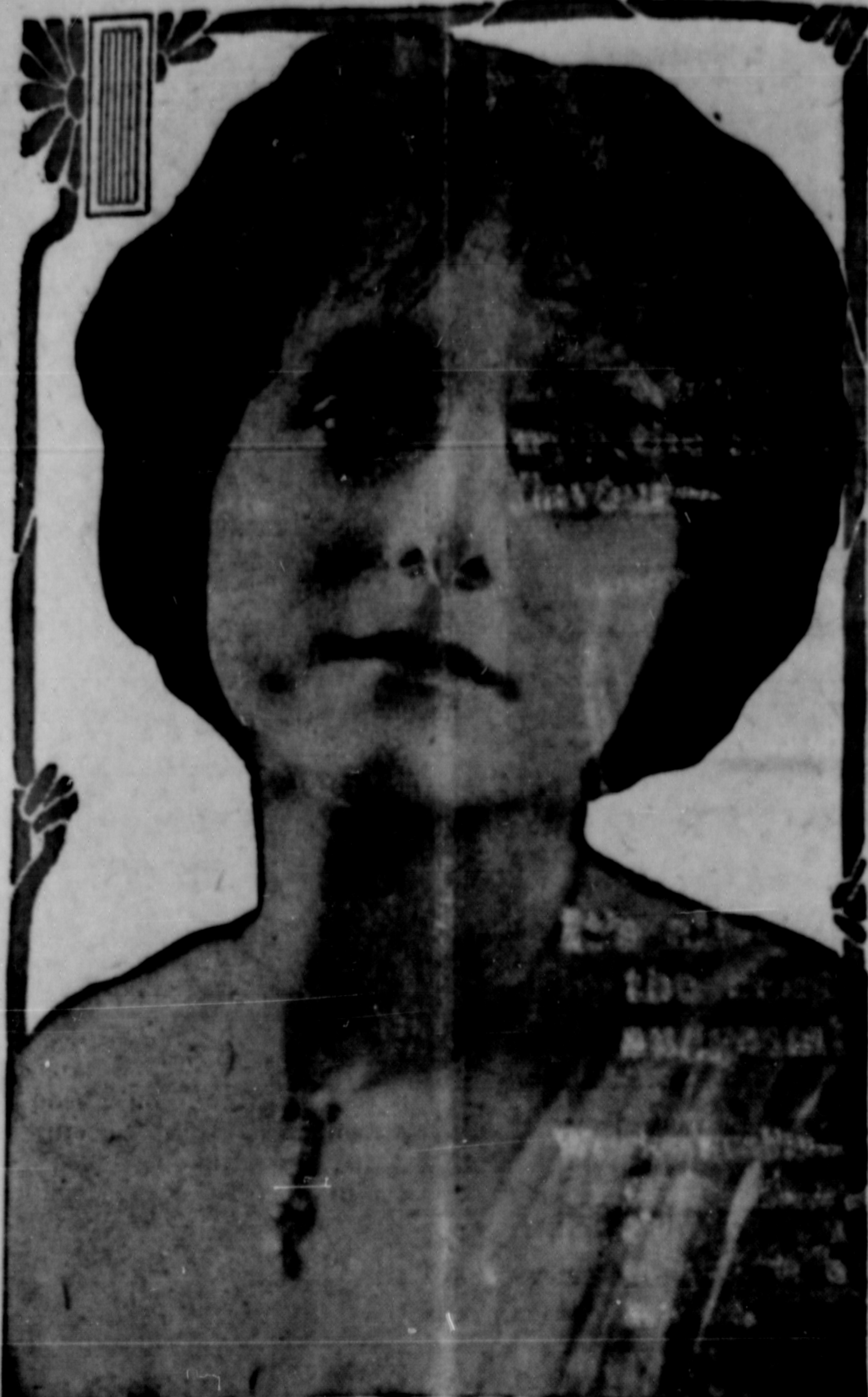
DOROTHY BERNARD DIRECTION WILLIAM FOX