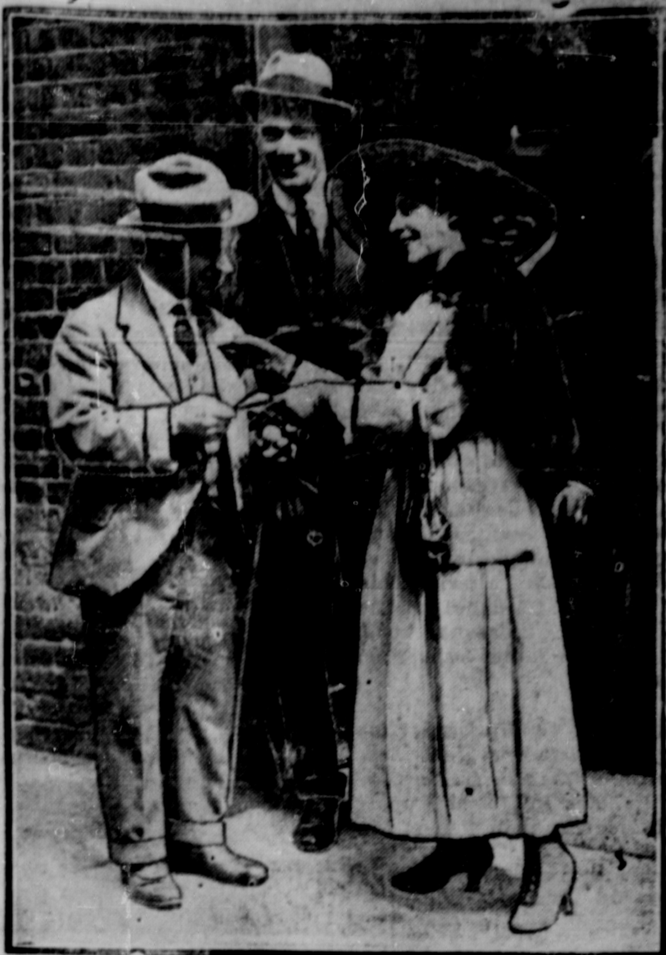
HARRY LAUDER FLAGGED—PARTS WITH A £1 NOTE

Box 41—4th Ave. and Emmerson Place. Box 42—5th Ave. and McBride St. Box 43—5th Ave. and Green St. Box 44—6th Ave. and Basil St. Box 45—7th Ave. and Eberts. Box 141—7th Ave. and Young St.