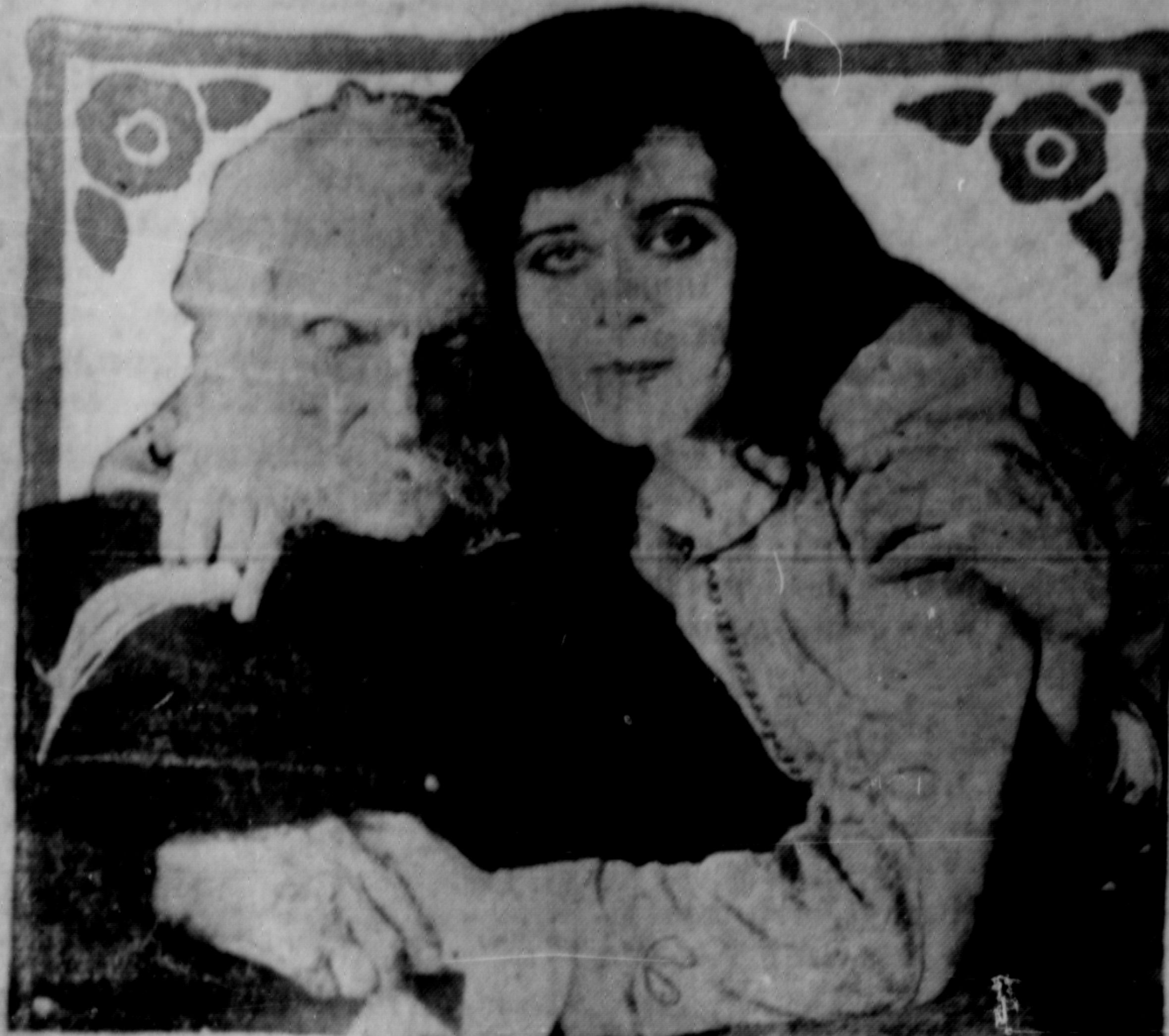
Scene from "Under Two Flags," showing at the Westholme tonight