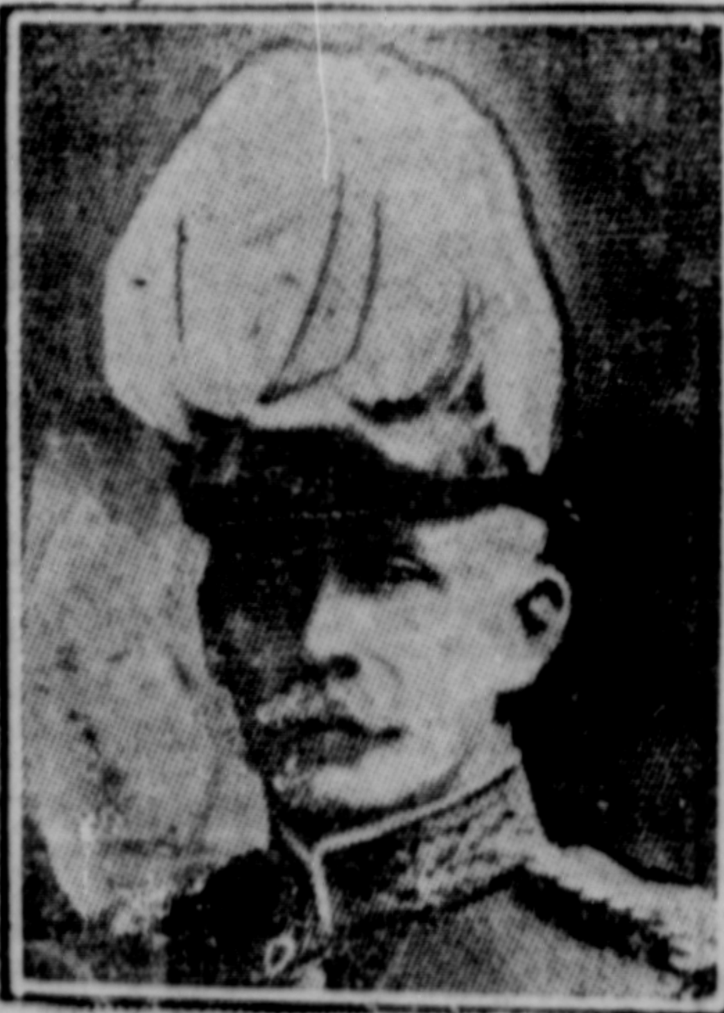
MAJ-GEN. SIR CHAS. FERGUSON In command of the Fifth Division of the British expeditionary force now in France.

Public meetings, Tuesday, Thursday and Saturday at 8 p. m. Sundays at 7:30 p. m.