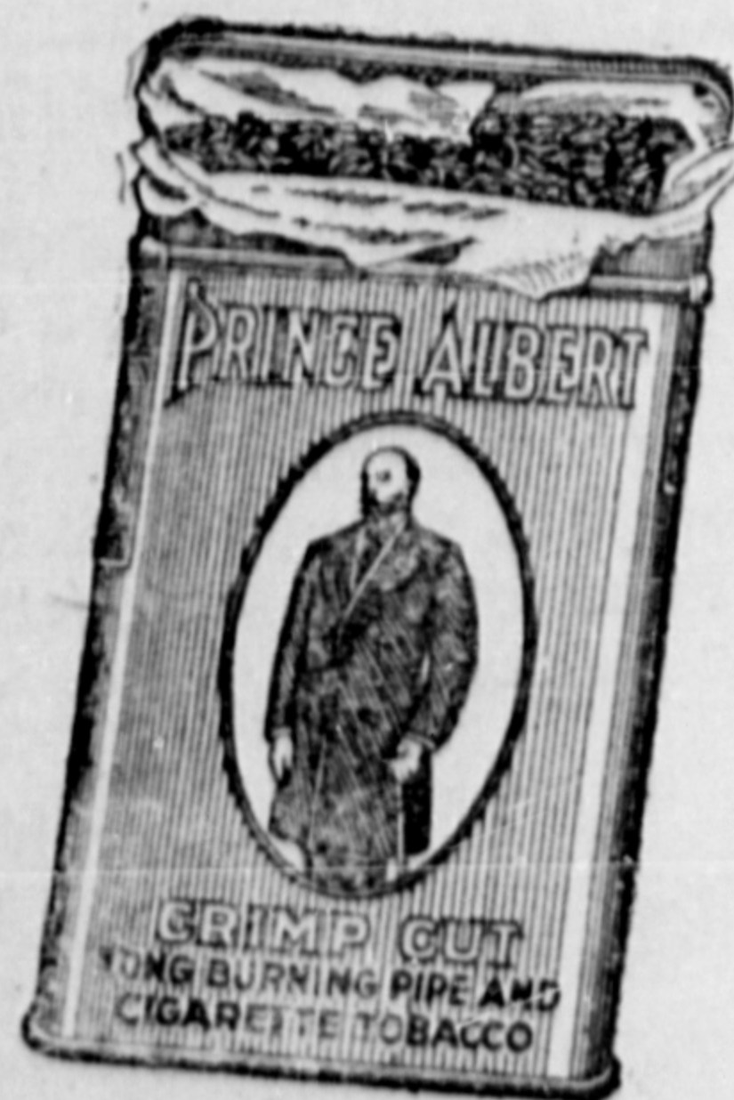
On the reverse side of this tidy red tin you will find: "Process Patented July 30th, 1907," which has made three men smoke pipes where one smoked before!

This little talk is also for men who think they're on the right track. All to be said is that the sooner you lay out the price for a supply of Prince Albert, the sooner you'll make a discovery that'll be worth a lot to your peace of mind and tongue! If your dealer cannot supply it, ask him to secure Prince Albert through his wholesaler. Get the idea of smoking all you want without a comeback—that's P. A.!