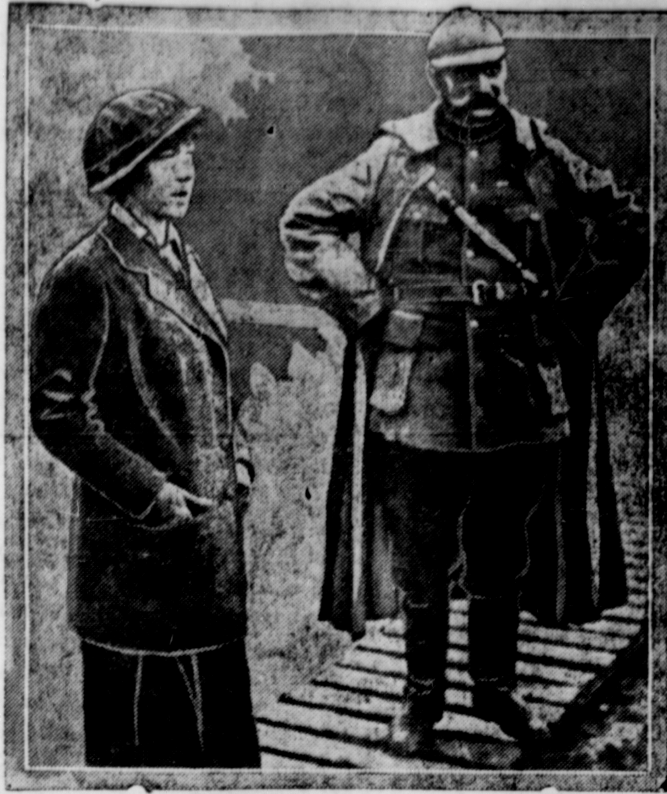
THE QUEEN WITHOUT A COUNTRY, AT THE FRONT