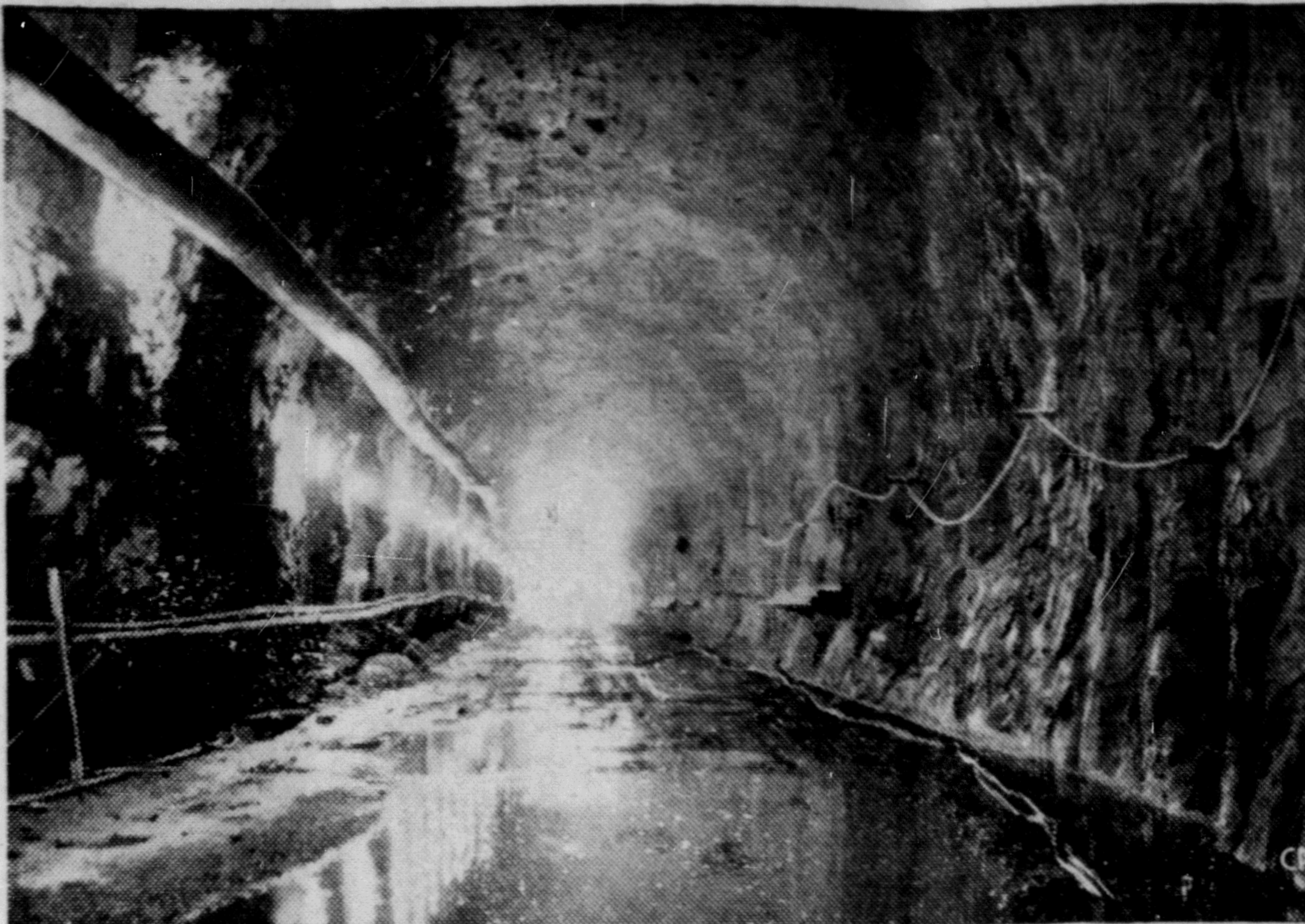
A TAIL-RACE TUNNEL, which channels water into the Kemano River, is one of a series built through the coast mountain range for the $550,000,000 aluminum industry under construction at Kitimat, B.C., 450 miles north of Vancouver. Water is backed up from the Nechako dam to create a 350-square-mile watershed and is carried through a tunnel to the power site 125 miles west of the dam. The water then is carried off through a tail-race tunnel to the Kemano River which joins the Pacific Ocean at Gardner Canal.