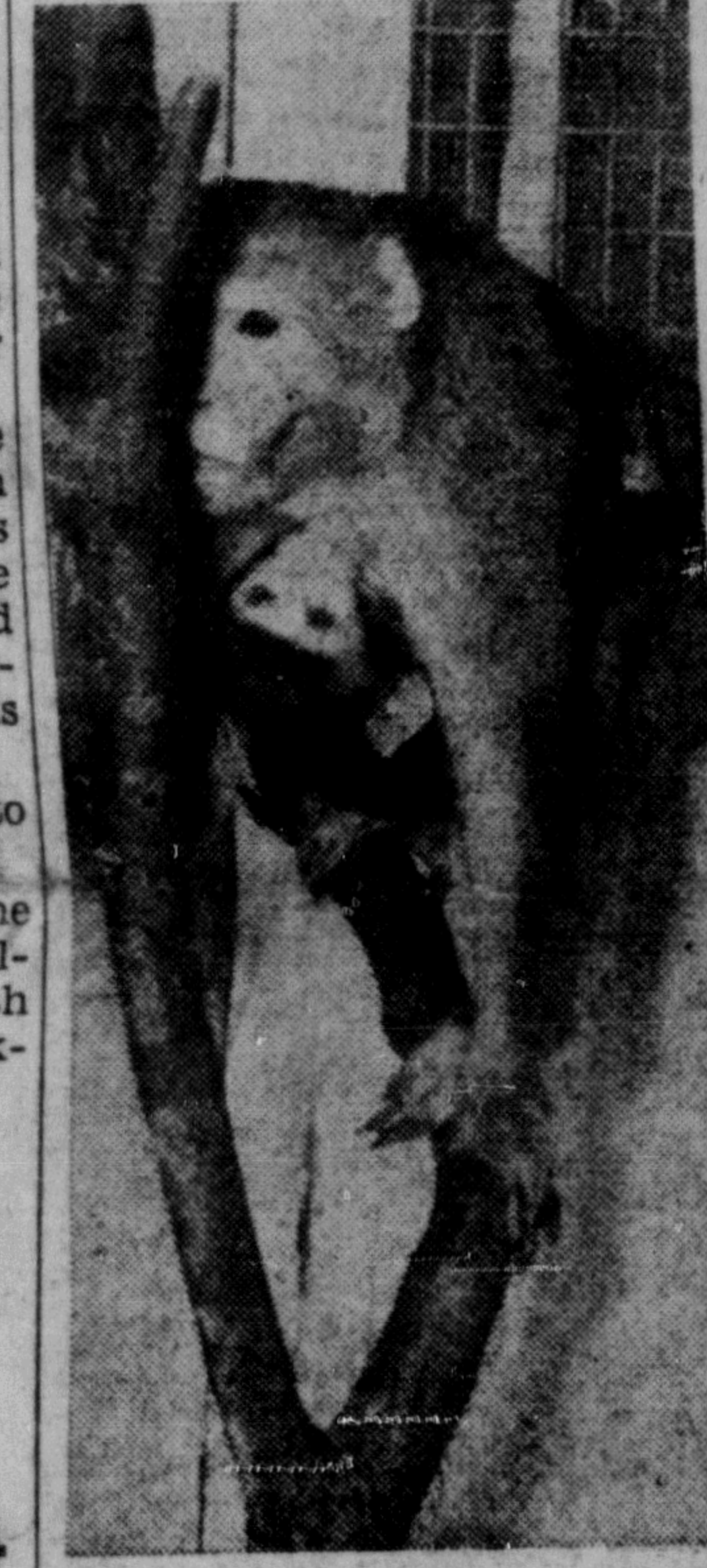
LET'S PLAY —This baby monkey hardly gives its mother any rest and played a big part here entertaining the children who visited the African Zoo Train. The specially-built railway cars that house the birds and animals is on show at Terrace today.

The Allied move made no change in the basic U.N. position that no prisoner would be forced to return to Communist rule. However, it would allow the Reds to announce that all prisoners were repatriated.