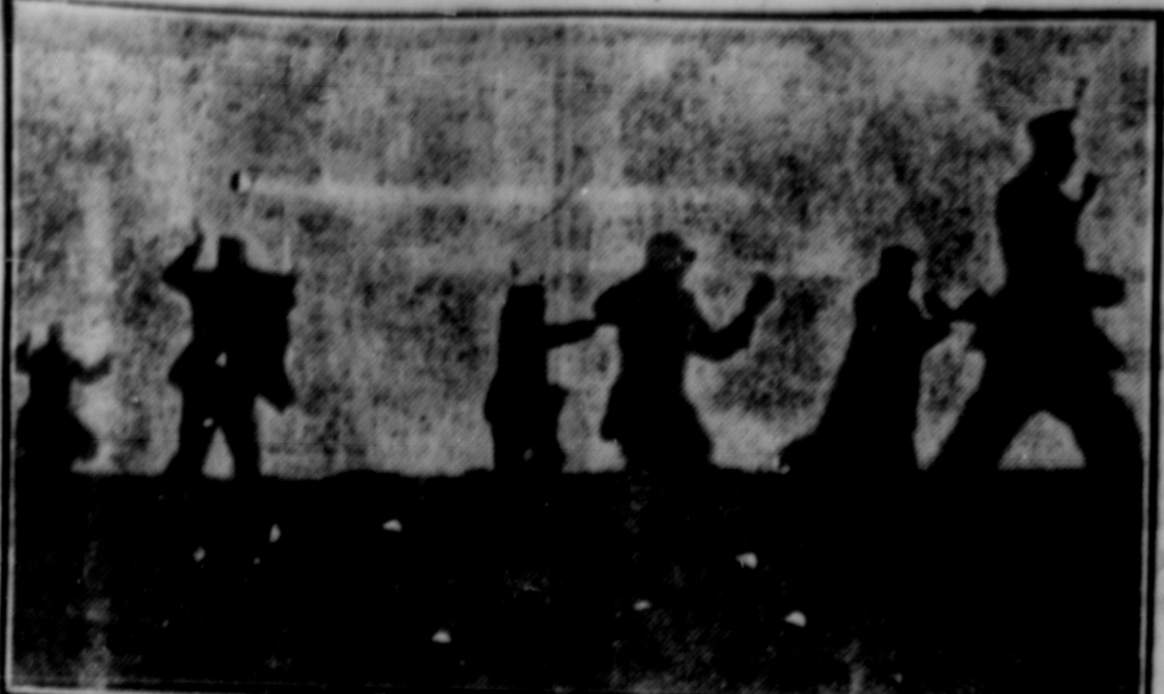
"Kamared! Mercy!"—Remarkable Photo Made from French Trench. Surprised by an attack before dawn by dismounted French Cuirassiers at Laffaux, these Germans rushed out with their hands raised high over their heads shouting "Kamared, Mercy." This striking photograph was taken at four o'clock in the morning and the figures of the captive Boches are strongly silhouetted against the weak light on the early dawn. The attack was made by the French 9th Cuirassiers on foot.