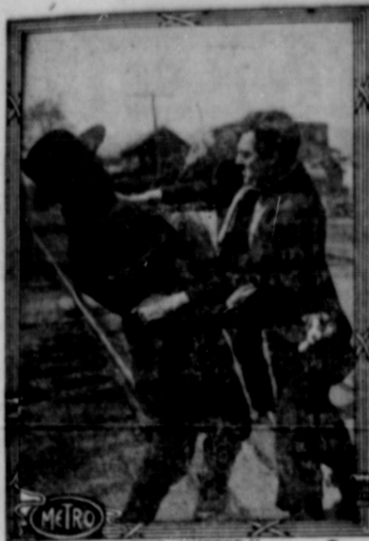
Showing at the Westholme tonight.

The photoplay billed for tonight at the Westholme is entitled "The Quitter." This is a story of the wild West, as it was not so very long ago. The scene is laid in Paradise Gulch, and the story tells of the scape goat of the mining town turning a practical joke into a real romance. It is a very vivid representation of the days that are past, never to return in this western country. There will also be a fine comedy and a Pathe Gazette, which makes up a very fine programme.