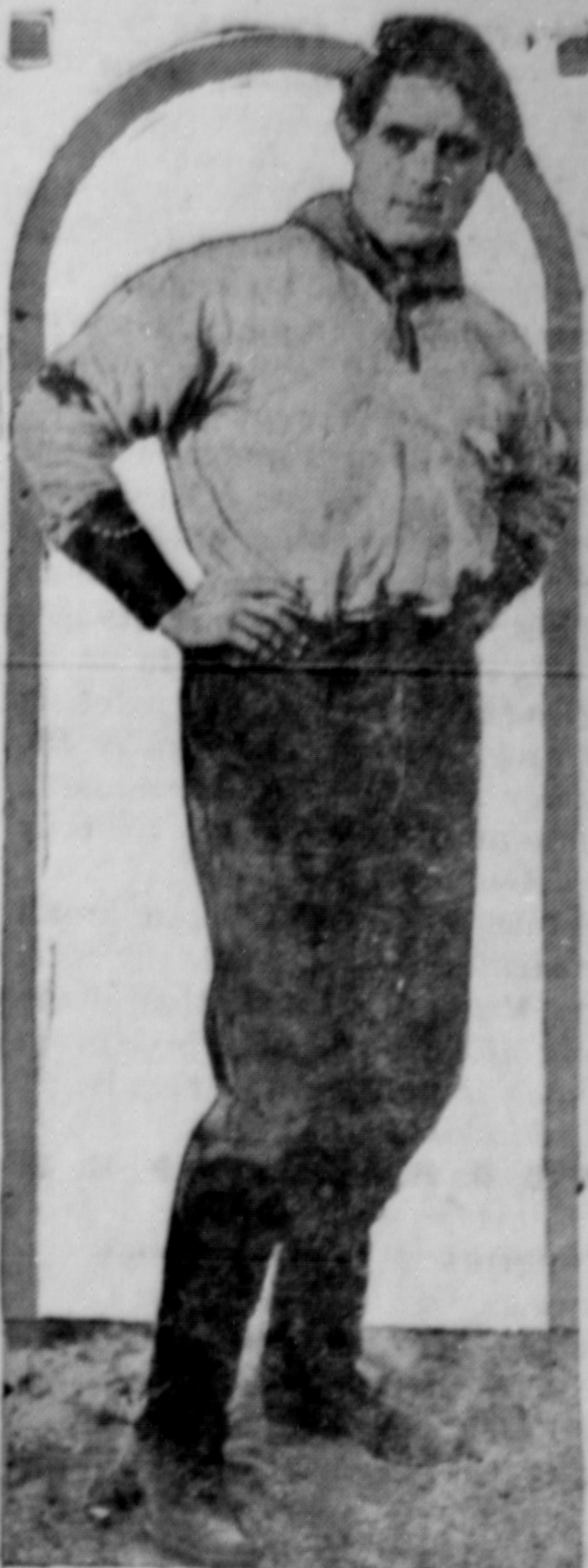
THE BEAST WILLIAM FOX PRODUCTION