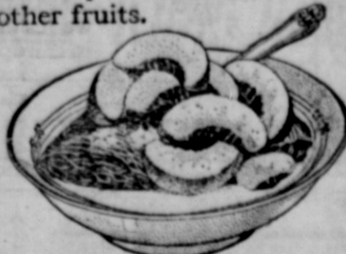
Made in Canada.

Join the Whole-Wheat Club for food conservation—substitute whole wheat foods for meat. More real body-building nutriment for less money. Shredded Wheat Biscuit is 100 per cent. whole wheat in a digestible form. Nothing wasted, nothing thrown away. Deliciously nourishing for any meal with milk or cream and sliced peaches, bananas or other fruits.