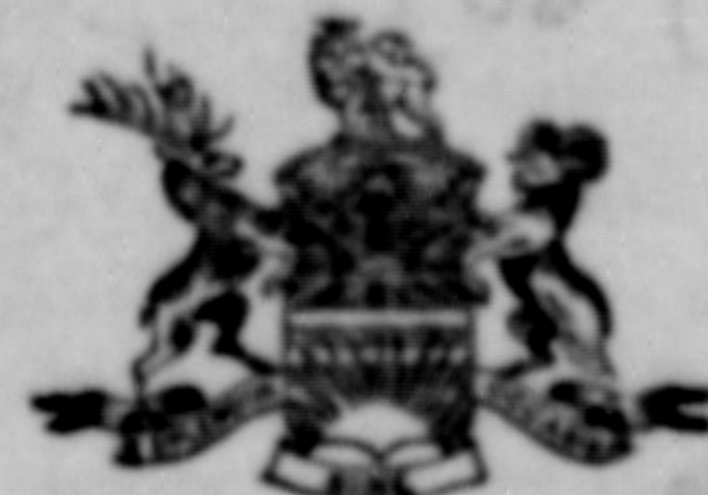
TIMBER SALE X 1065.

Public meetings, Tuesdays, Thursdays and Saturdays at 8 p. m. Sundays at 7:30 p. m.