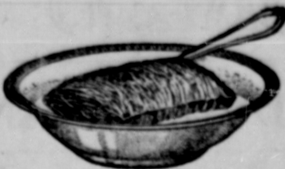
Made in Canada.

It may be the forerunner of bronchitis or a bad cold. It is nature's warning that your body is in a receptive condition for germs. The way to fortify yourself against cold is to increase warmth and vitality by eating Shredded Wheat , a food that builds healthy muscle and red blood. For breakfast with milk or cream, or any meal with fresh fruits.