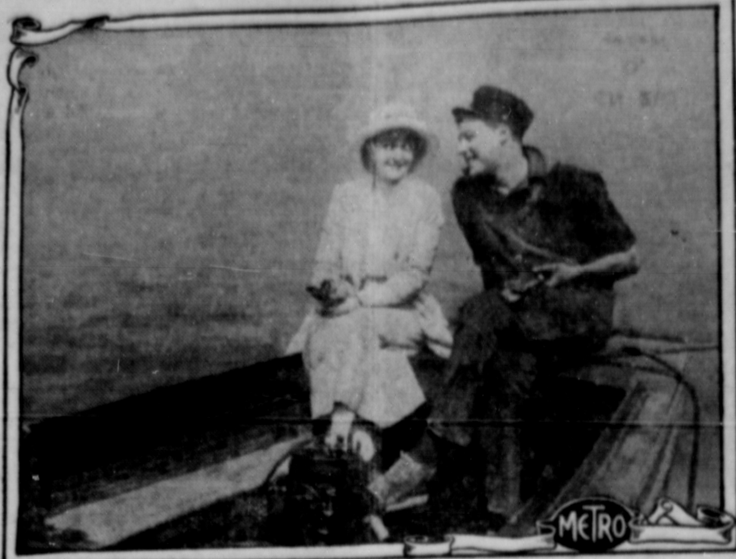
Scene from "THE RIVER OF ROMANCE" Showing at the Westholme Theatre tonight.