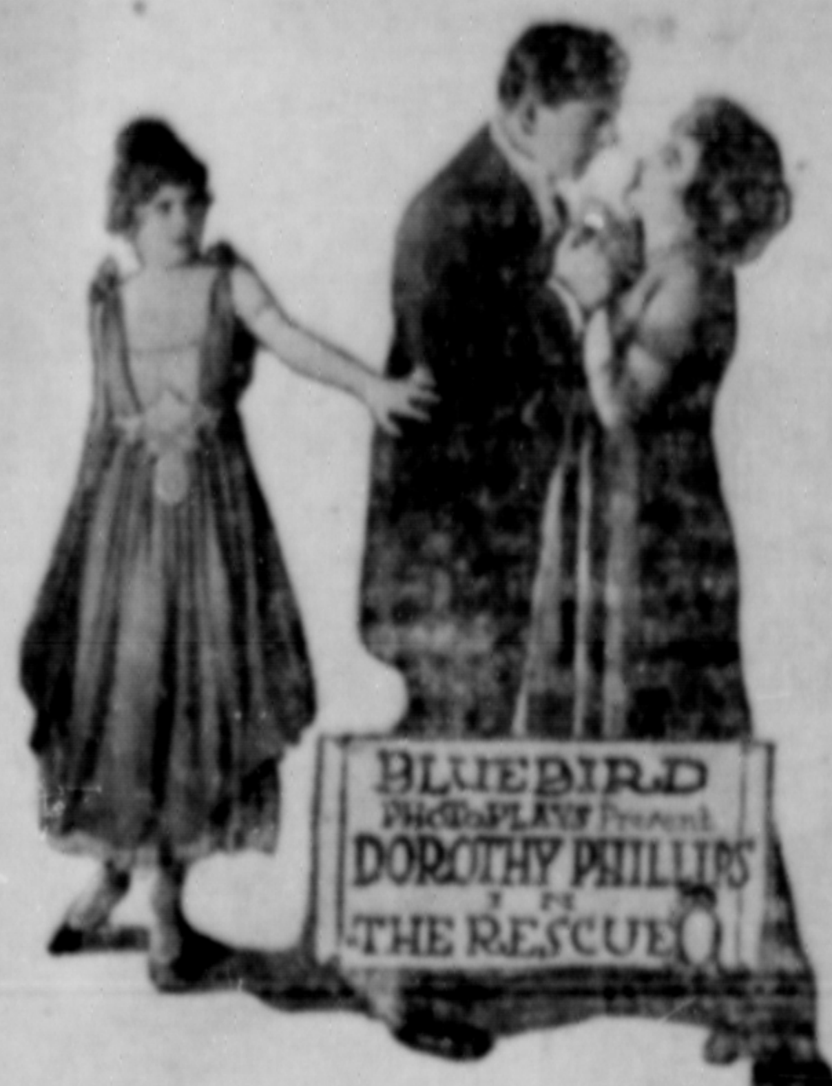
Showing at the Westholme Theatre tonight.