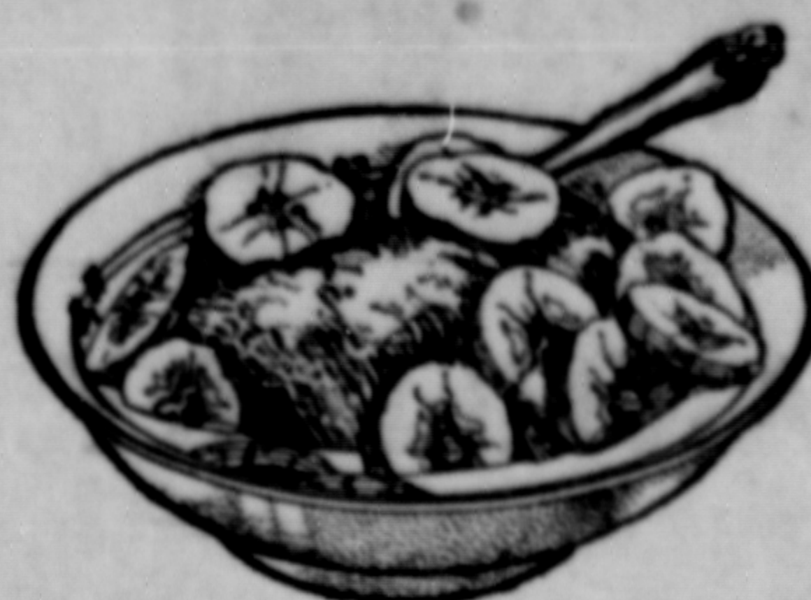
Made in Canada.

In These War Times you want real food that contains the greatest amount of body-building material at lowest cost. The whole wheat grain is all food. Shredded Wheat Biscuit is the whole wheat in a digestible form. Two or three of these little loaves of baked whole wheat with milk and a little fruit make a nourishing, strengthening meal.