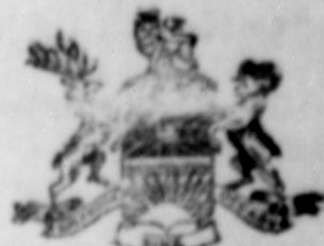
TIMBER SALE X 1082.