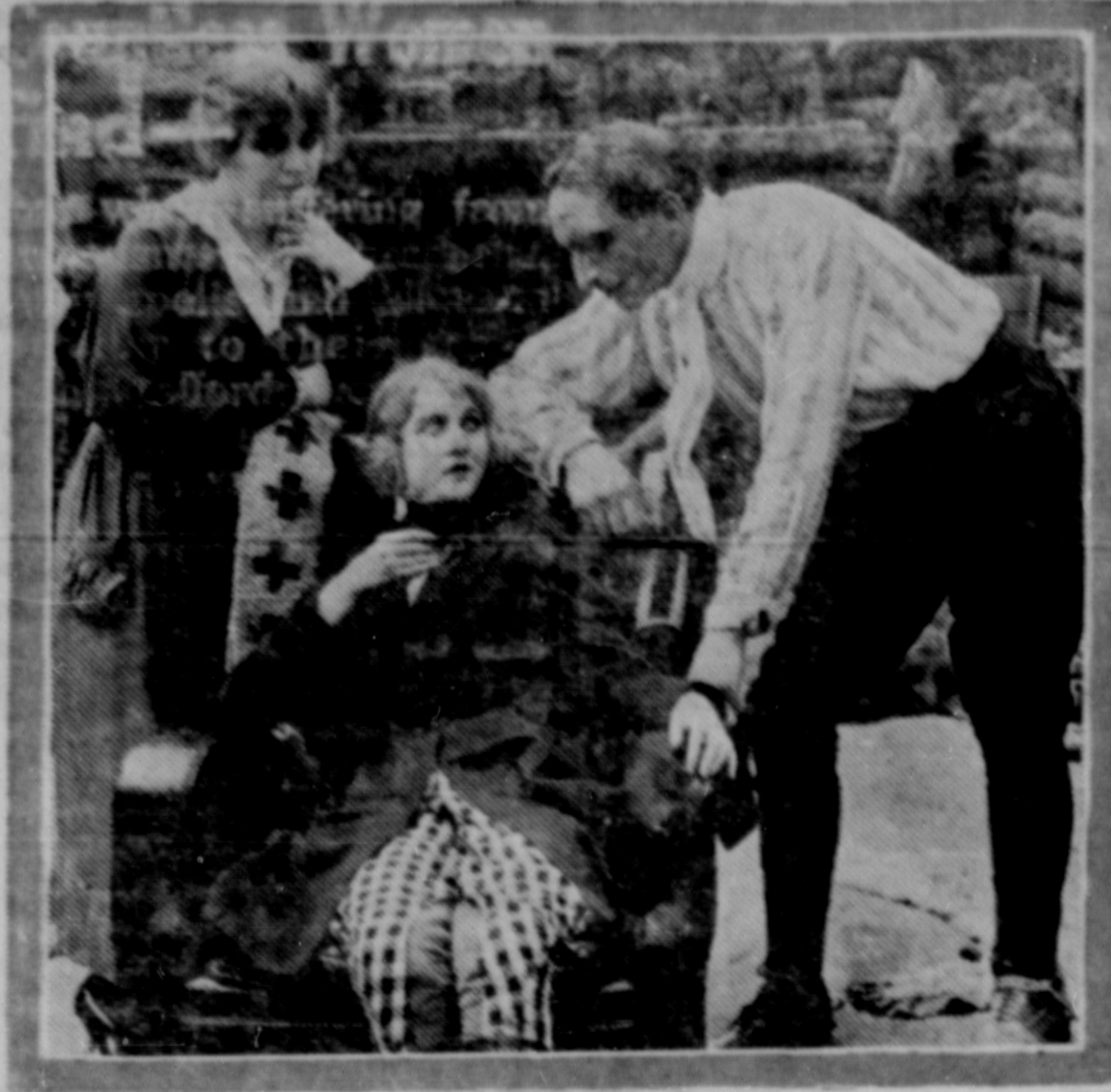
THE PRIMITIVE CALL WILLIAM FOX PRODUCTION At the Westholme Theatre to-night.