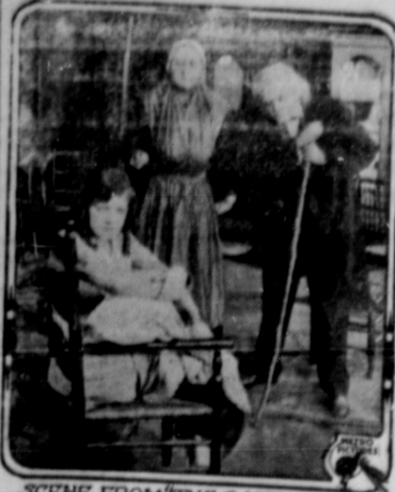
SCENE FROM "THE GATES OF EDEN"