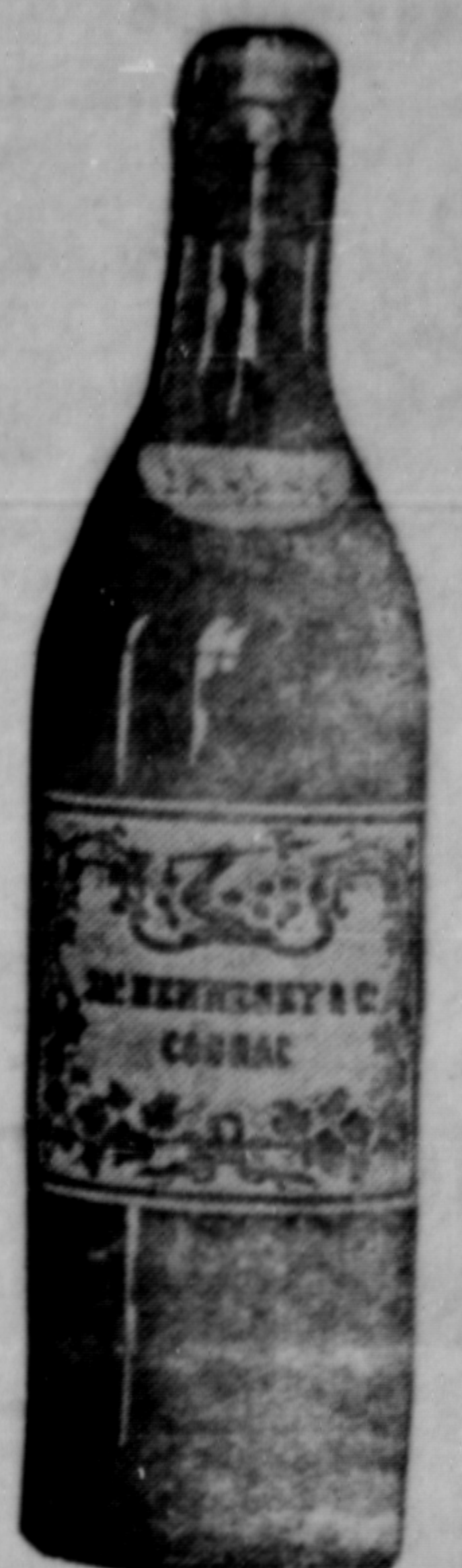
Hennessy's Three Star Cognac—1 Bot. $4.00 3 bottles $11.55, case of 12 bottles $45.00.

We never substitute We give full measure We give full count