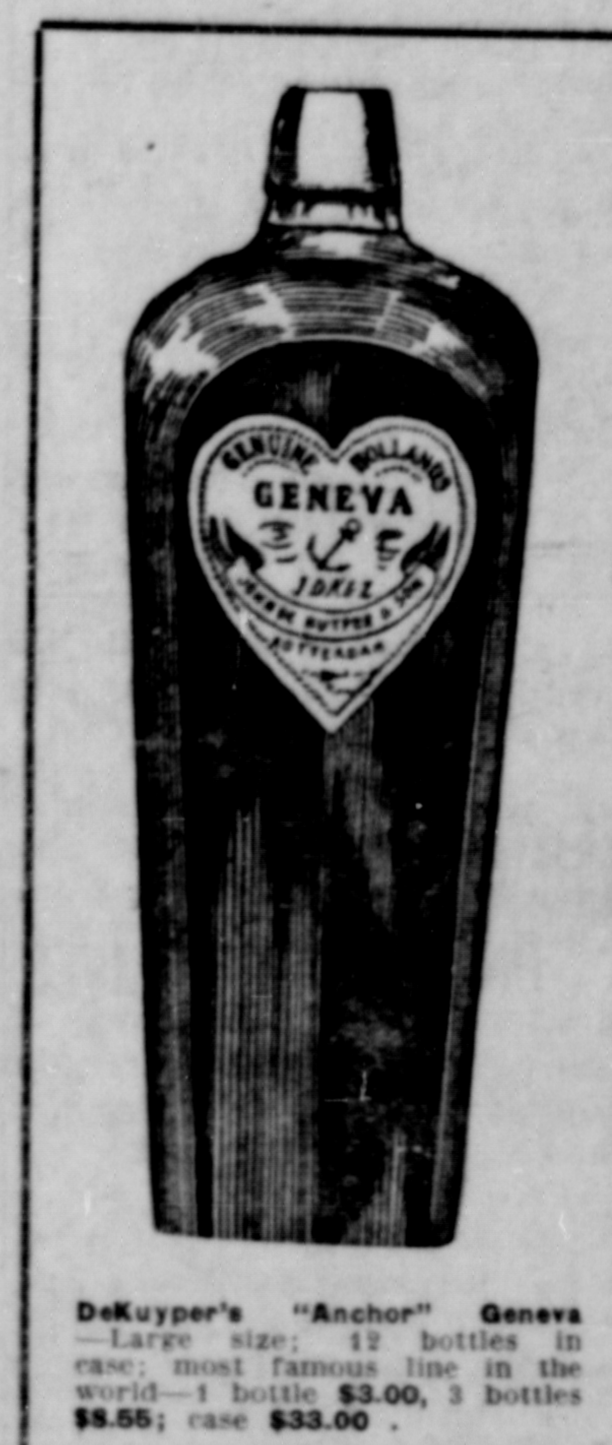
DeKuyper's "Anchor" Geneva—Large size; 12 bottles in case; most famous line in the world—1 bottle $3.00, 3 bottles $9.55; case $33.00.