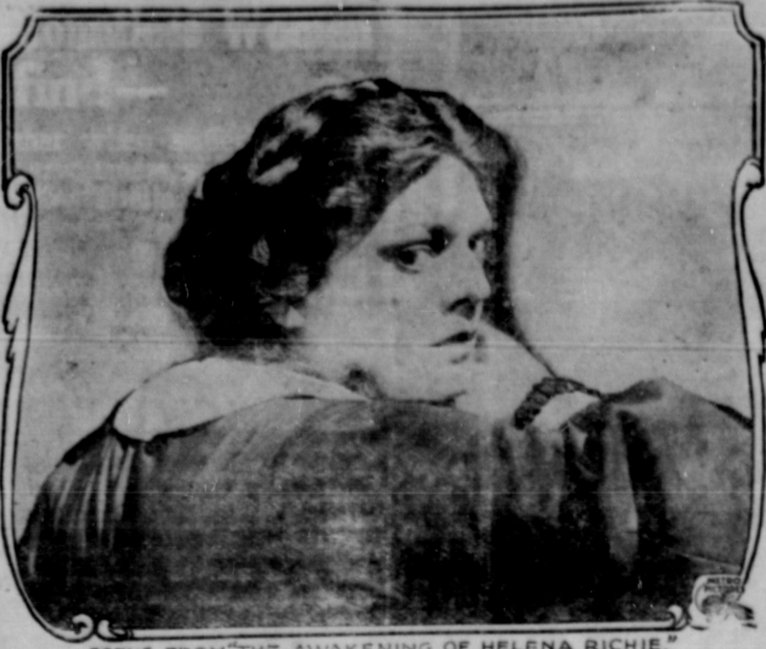
SCENE FROM "THE AWAKENING OF HELENA RICHIE," Showing at the Westholme tonight

Easter Cards and novelties for March 29, at McRae Bros., Ltd. 74