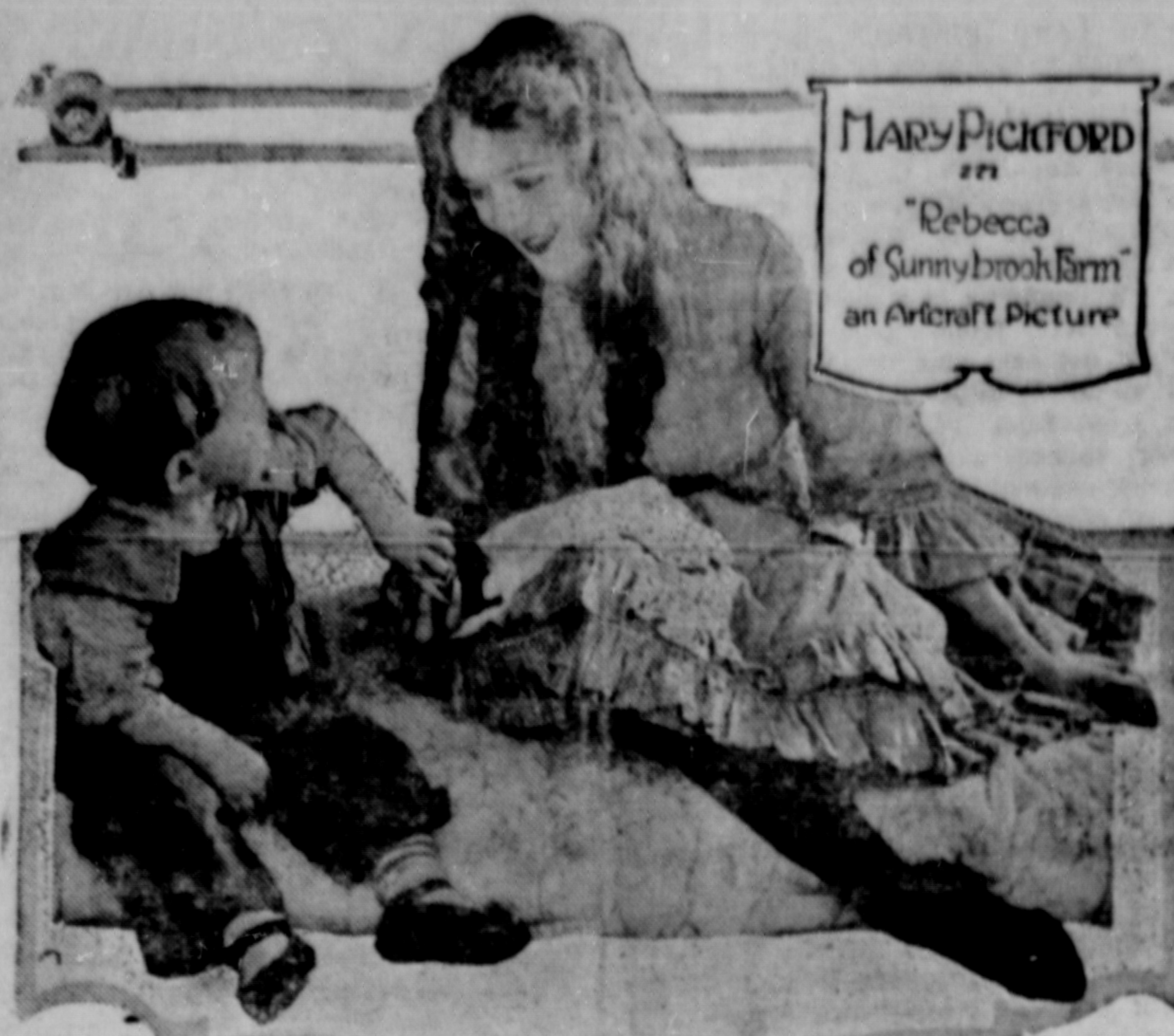
Showing at the Westholme tonight