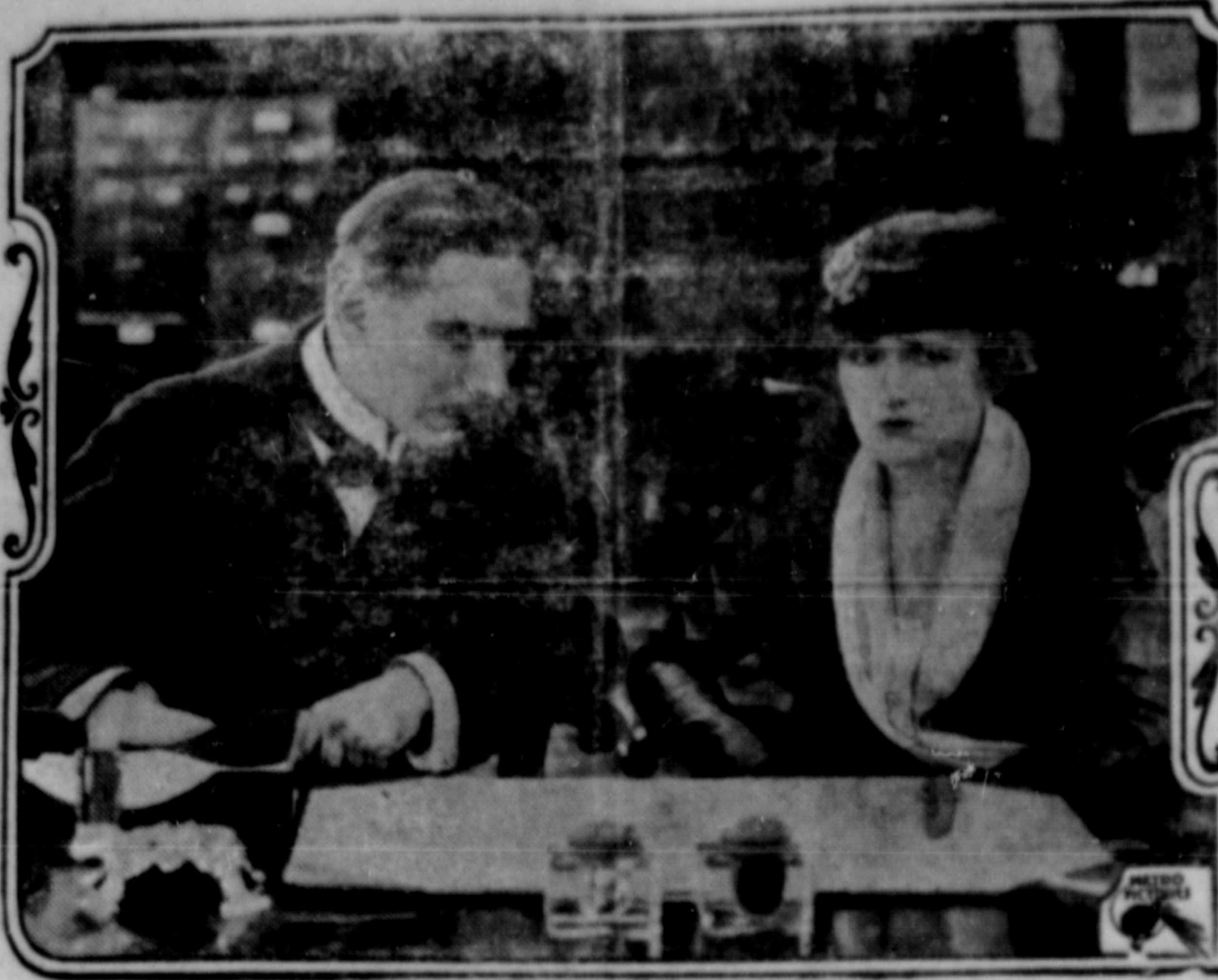
SCENE FROM "VANITY" Showing at the Westholme tonight