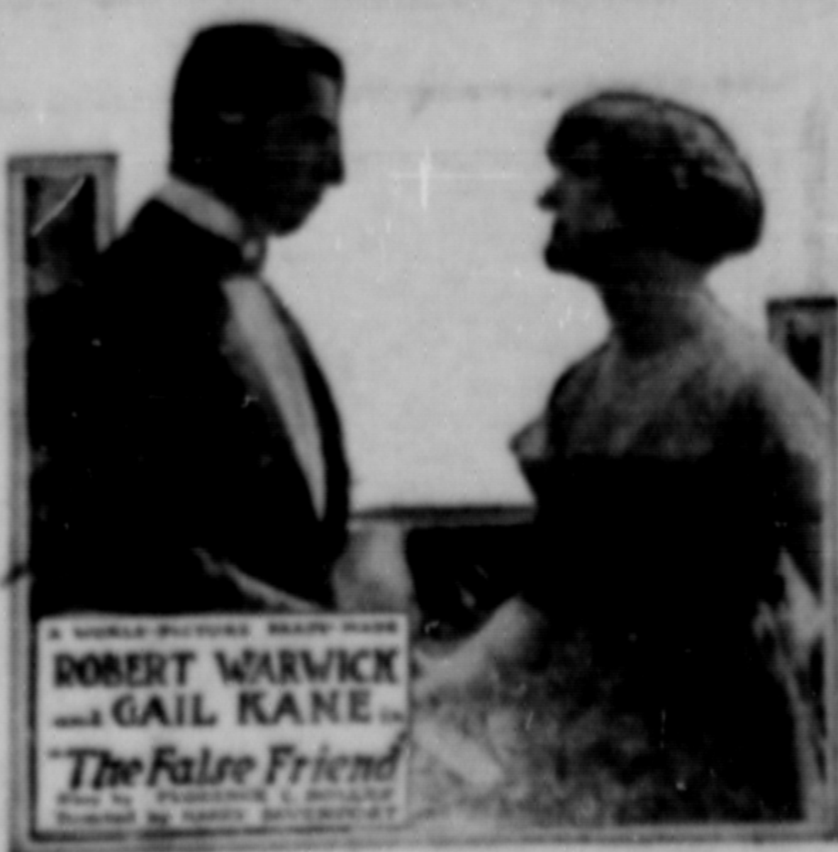
Showing at the Westholme tonight

Cock-a-doodle dum! My dame has lost her gum, My Master's gone to get her some, She'll be all right when he has come—with Wrigley's!