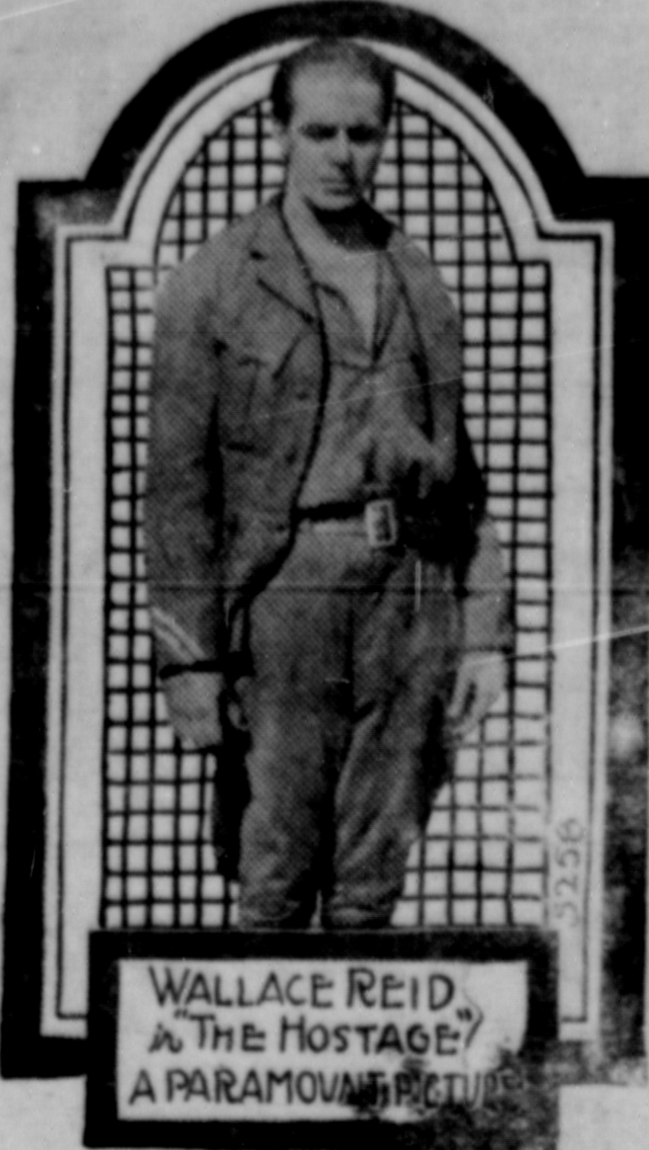
Showing at the Westholme tonight

By getting the best men for the jobs of governing, a true aristocracy will be produced, which may end in producing a true democracy. The Labor government of the future has magnificent opportunities before it. The great changes now required are a more equitable distribution of wealth, the disappearance of idleness, and of useless luxury in all classes, and the closer association of employers and employed. Such reforms are attainable if there be understanding and goodwill on all sides. "Seek out wisdom," said the preacher, "but with all thy getting get understanding." With a real democratic government, it may be that remedies will be found for the patent evils from which the people have too long suffered. Revolution can only occur when the principles of democracy are flagrantly violated, as has happened in Russia, which is providing object lessons of